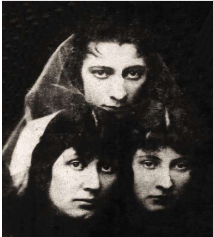
The three Obrecht Sisters, 1920