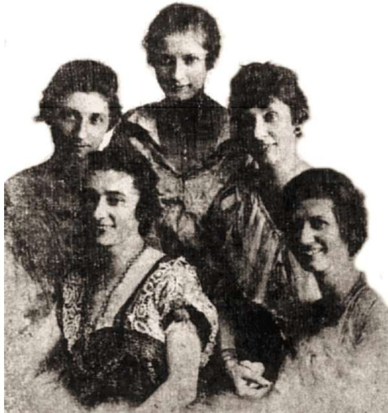
The Obrecht sisters, 1917