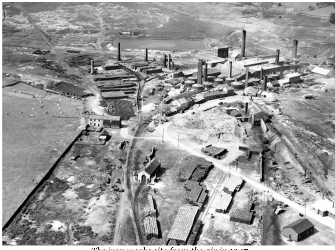
The iron works site from the air in 1947