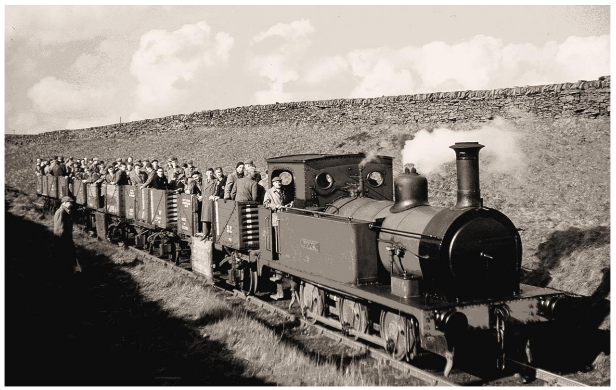
One of the excursion trains to/from the ironworks