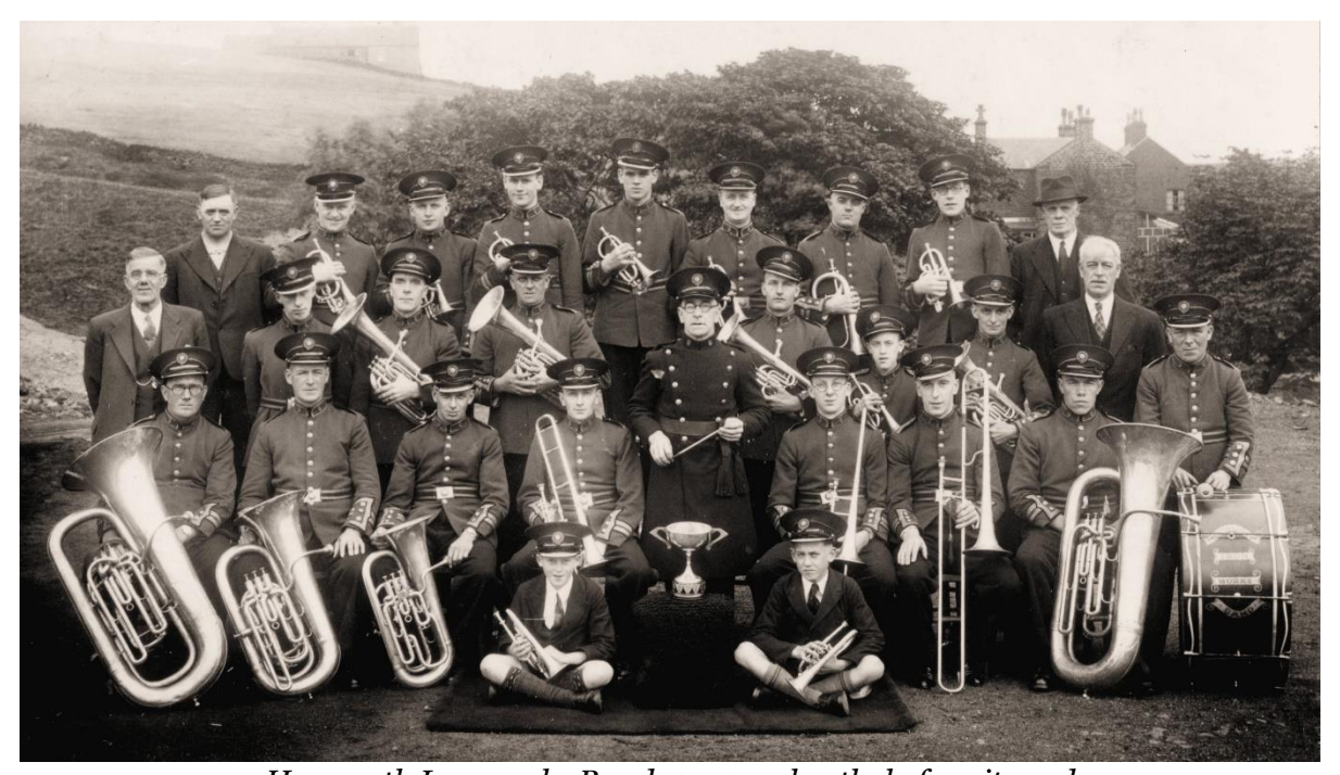
Hepworth Ironworks Band, 1950 – shortly before its end