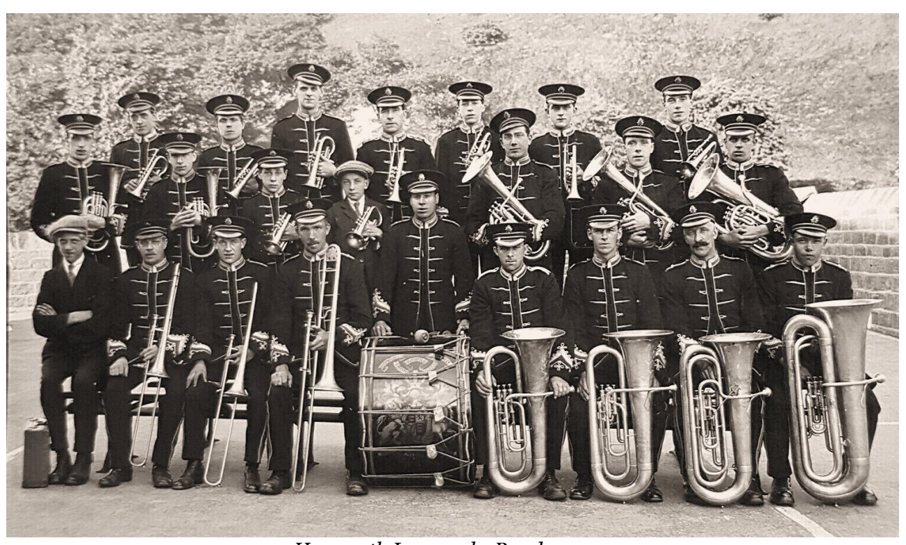
Hepworth Ironworks Band, c. 1915

The Hepworth Ironworks Band disbanded in 1950.