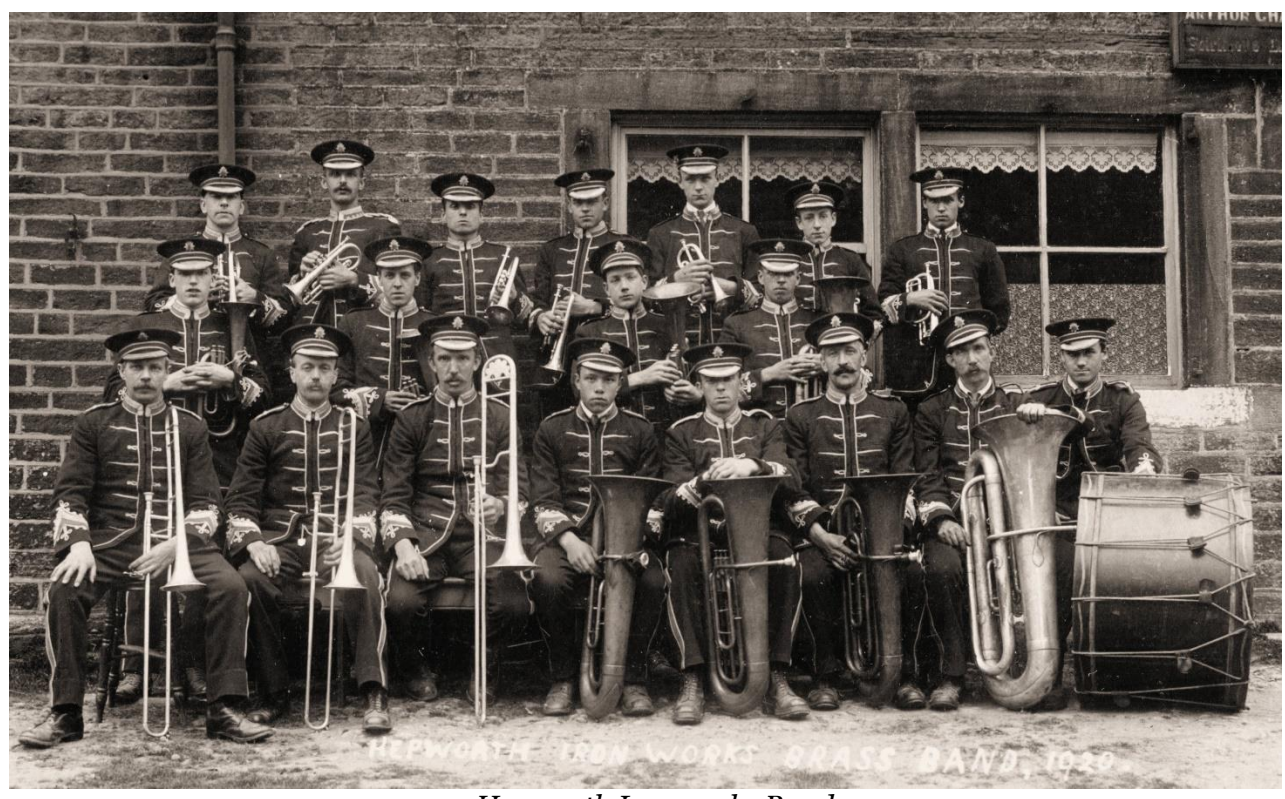
Hepworth Ironworks Band, 1920