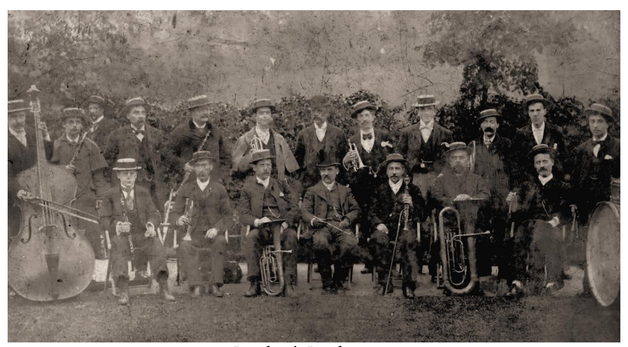
Dearlove's Band, c. 1900