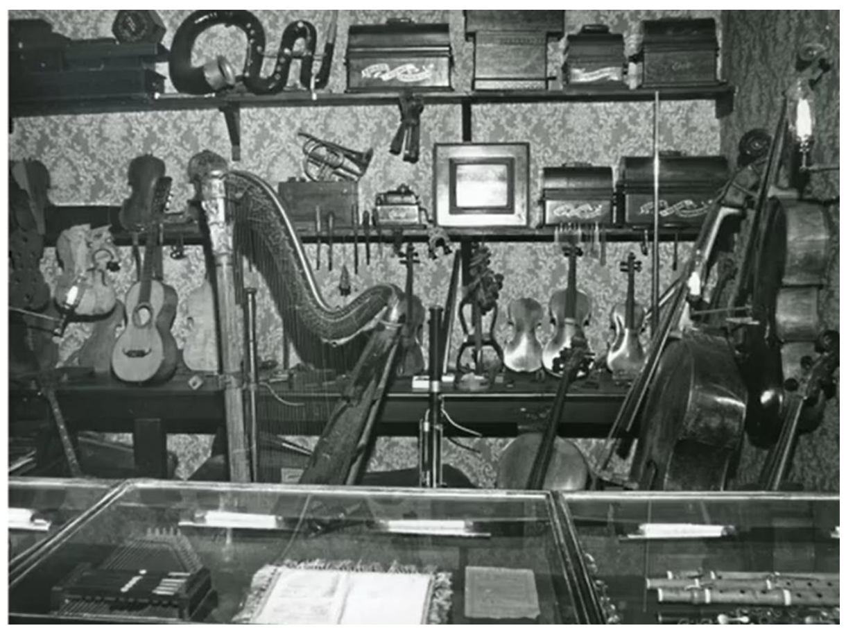
Interior of the Dearlove shop, as displayed in the museum