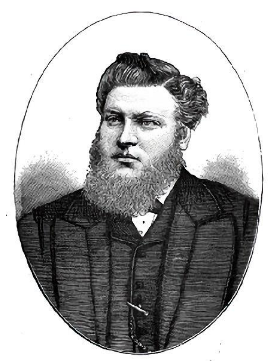
{\it Joseph-illustration from "Stray Leaves"}