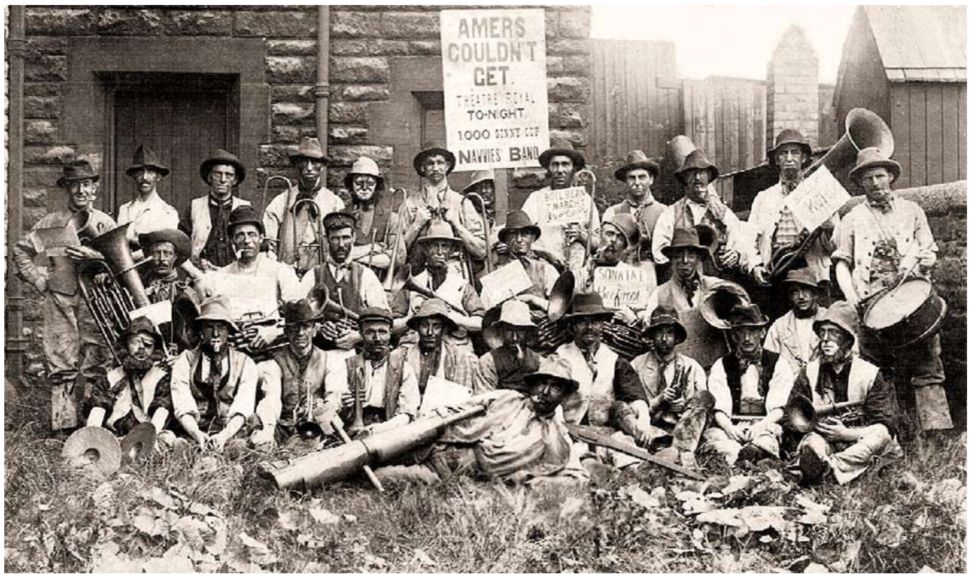
The Jarrow Congo Navvies' Band, c. 1906

The Cycle Club attended various meets during 1908, including the South Shields Parade in fancy dress, but the Navvies' Band only appeared for the Distress Fund collections. It was a similar situation in 1909, with the Club making good use of its cycling events, but giving the Navvies' Band a rest.