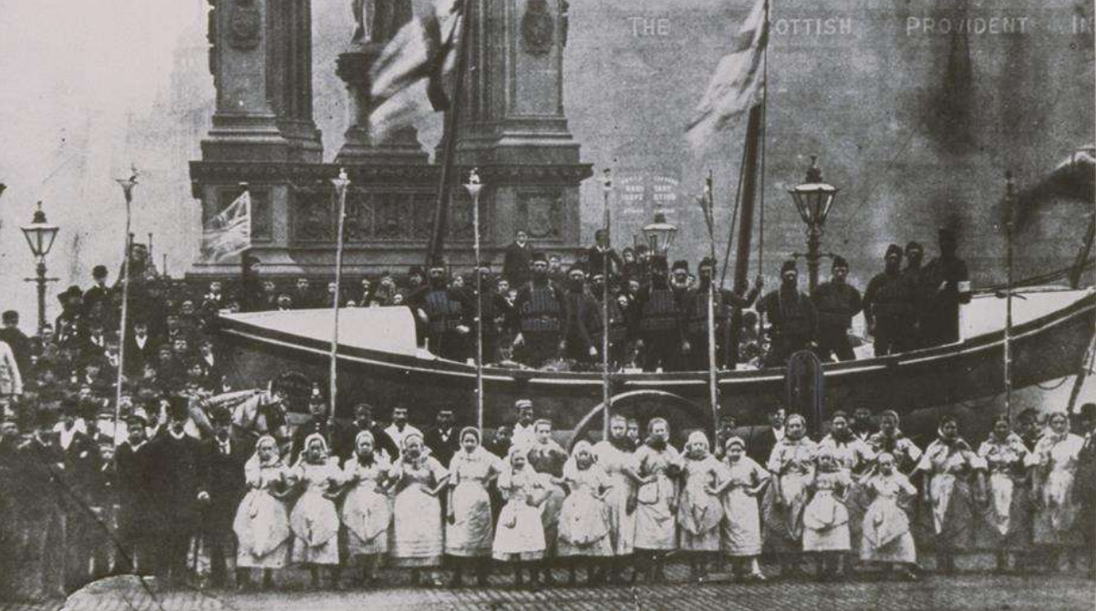
Participants in the first Lifeboat Demonstration, Manchester, 1891

Lifeboat Saturday Demonstrations had started in 1891, in Manchester, following the loss of two lifeboats and 27 men in 1886 in their attempt to rescue the crew of the German ship ' Mexico ' off the coast of Southport. Sir Charles Macara, who had witnessed the rescue operation, promoted the event in Manchester as a 'grand cavalcade to make the public at large aware of the service provided by the brave volunteer lifeboat men and the need for widespread financial support'. This was also the first occasion to use buckets and sacks to collect contributions for charity from the assembled crowds.