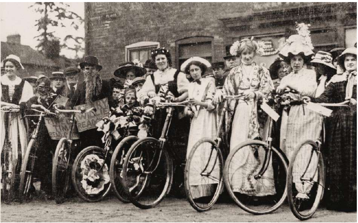
Cyclists in fancy dress

"The parade, the primary object of which was to amuse the people, prizes being offered with this object in view, was one of the best witnessed in this district Almost every conceivable character was represented in the gorgeous procession. A batch of 'convicts' in charge of a burly warder were responsible for considerable amusement, and when some of them bolted for the Cross Inn, with their warder in hot pursuit, the laughter was general."