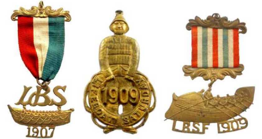
Typical medals awarded at the Lifeboat Saturday Demonstrations