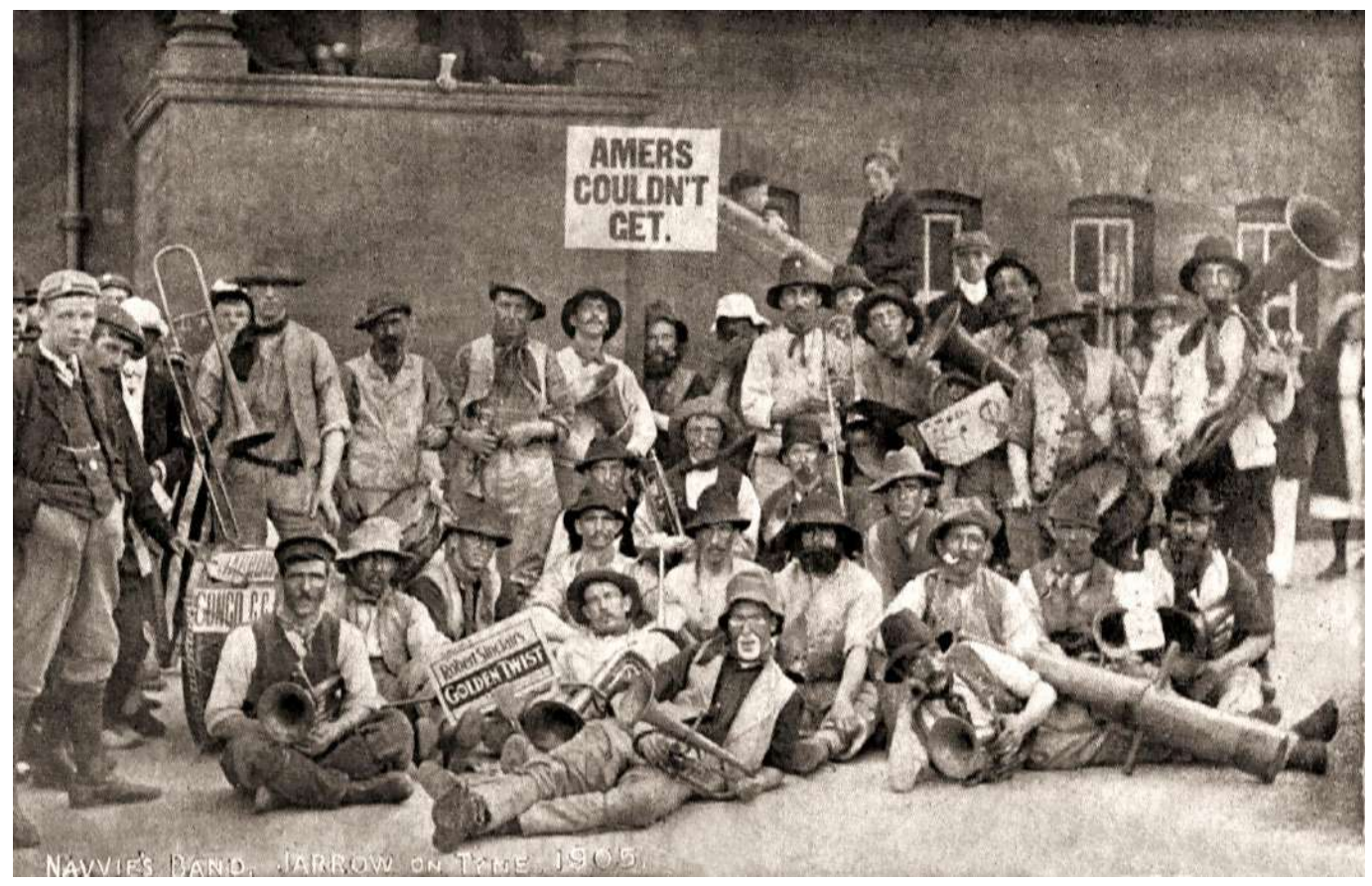
The Jarrow Congo Navvies' Band, 1905

which included the Jarrow Ramblers, South Shields West End Ramblers, Willington, South Shields Primitives, Sunderland Excelsior, St Anthony's Temperance, St Andrews and Heaton Temperance. The full parade was led by the boys' band of the Wellesley Training Ship, and the Jarrow Navvies' Band led the fancy dress cycle parade. Some of the fancy dress was quite elaborate – one competitor had a miniature blacksmith's shop, fully equipped and in working order, built over the handlebars of his bicycle.