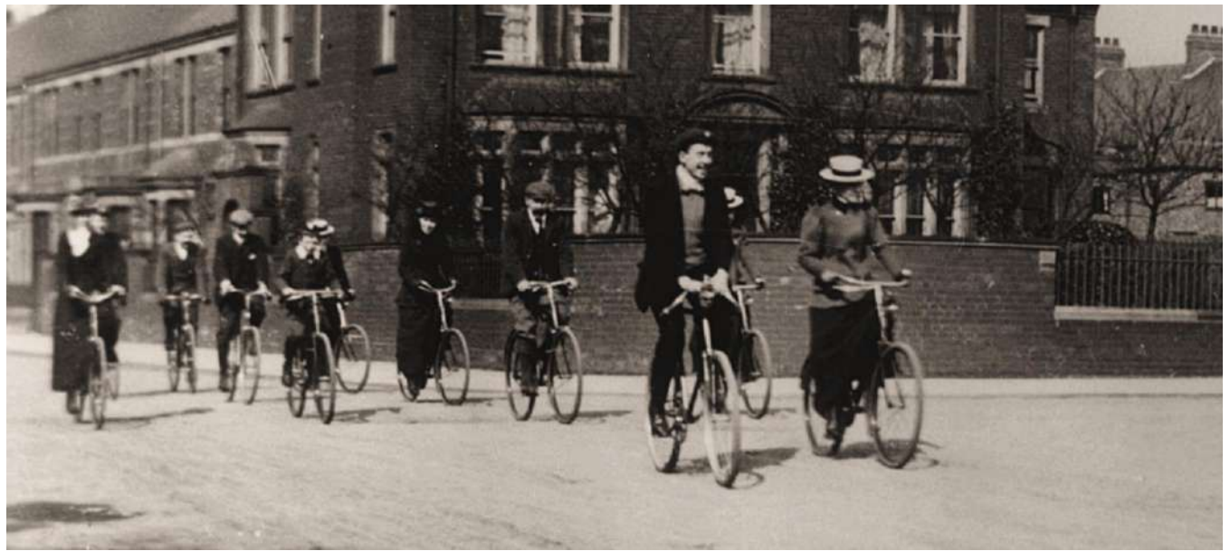
Members of the Jarrow Congo Cycle Club, in Jarrow, 1902

As with other successful and celebrated organisations, the Jarrow Congo Club's achievements over the year generated some envy from competitors. Some decided to promote themselves as the Jarrow Congo Combination Party for a 'Pleasant Saturday Evening' event. This was nothing to do with the real Jarrow Congos Cycling Club and Navvies' Band, and the public were quickly informed of this in the local press.