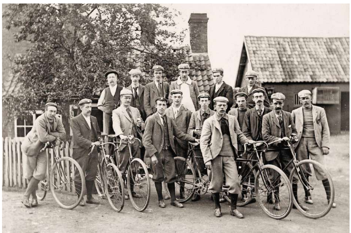
Members of a cycling club from Nottinghamshire, c. 1904

The Congo Cycling Club of Jarrow was founded in late 1898 or early 1899, one of a large number of similar clubs throughout England that held various events – rides, races, and meets, with and against the other clubs in their area. Although many of these Victorian cycling clubs were men only, there were also ladies cycling clubs and, towards the end of the century, mixed clubs – of which the Congos were one.