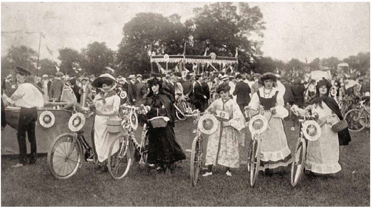
Ladies at a cycle meet, lining up for judging, 1905

The Navvies' Band was next seen at the Whitley Bay Carnival, on Wednesday 23 July 1913, as part of the cyclists' parade, which was promoted by the proprietors of the 'Spanish City'. Parading through the streets of the town they attracted great interest and amusement. The procession was headed by the band of the Wellesley Training Ship and also included the Scoutmasters' Band from Newcastle.