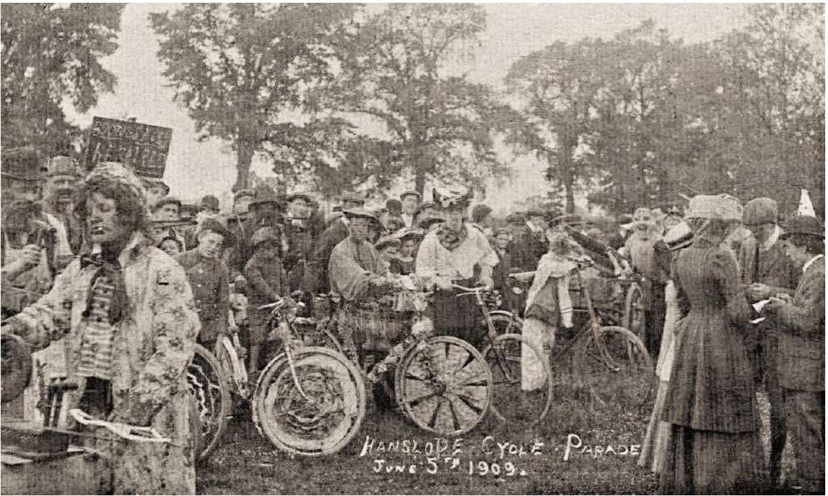
Hanslope Cycle Parade, 1909

On Saturday 4 September 1915, the Navvies's Band took part in the Belgian Flag Day procession and gala in Jarrow to raise money for the Belgian Fund.