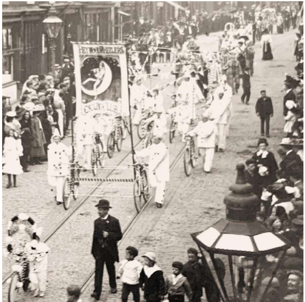
Cycle parade through Heywood, 1906

A great cycling carnival was held at South Shields, on Saturday 20 August 1910, in aid of the Ingham Infirmary. The Jarrow Congo Navvies' Band took part.