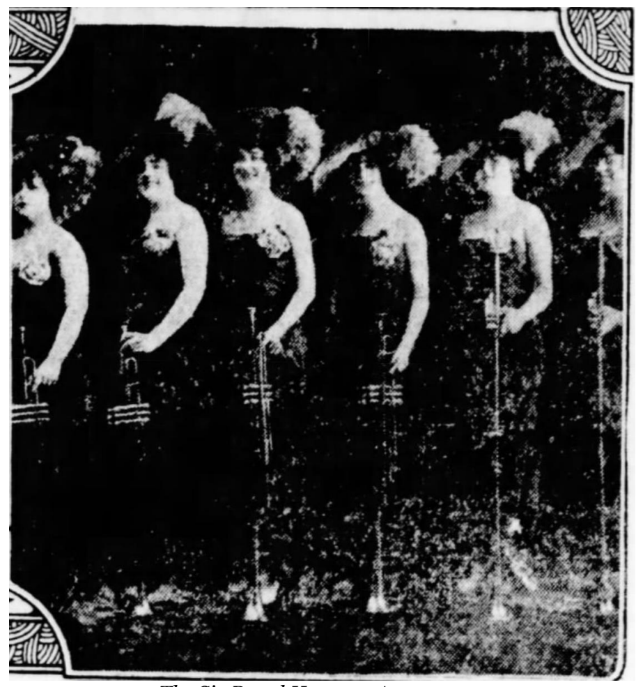
The Six Royal Hussars, August 1919