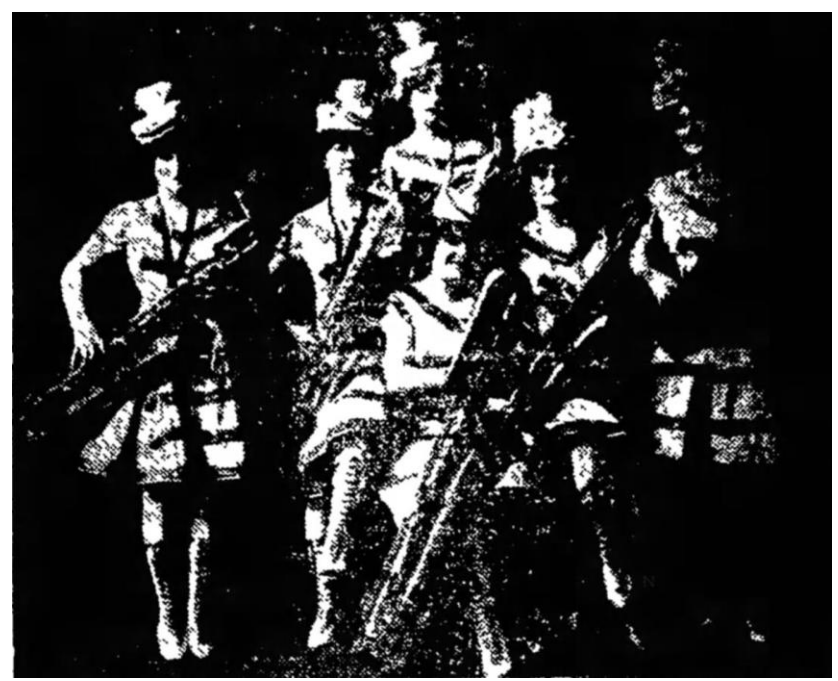
The Six Royal Hussars, January 1916