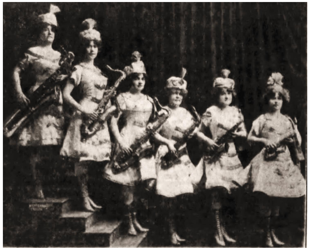
The Six Royal Hussars, October 1915