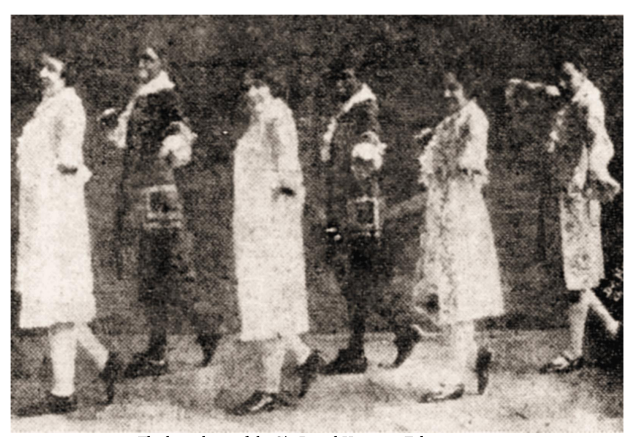
The last photo of the Six Royal Hussars, February 1921