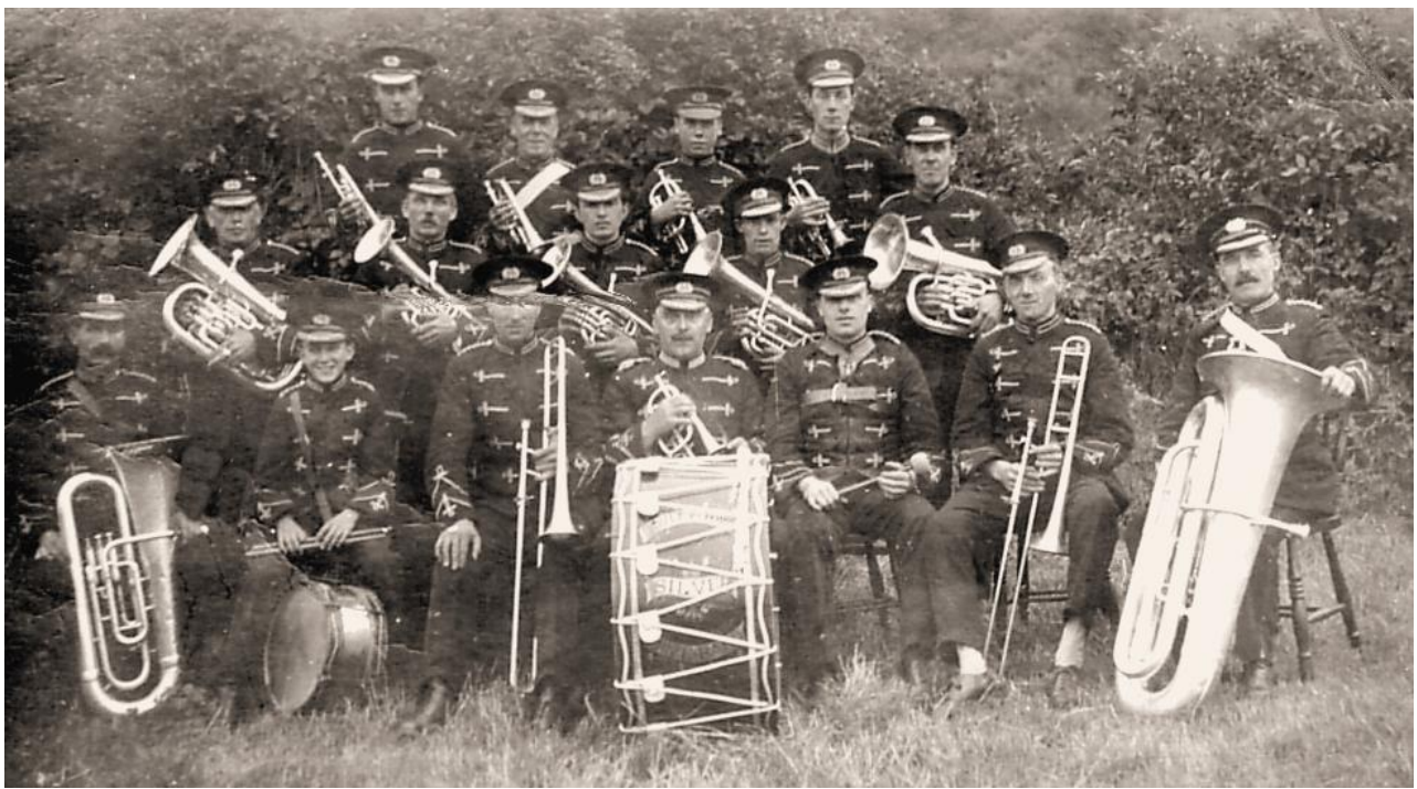
Dawley Town Silver Band, c. 1920