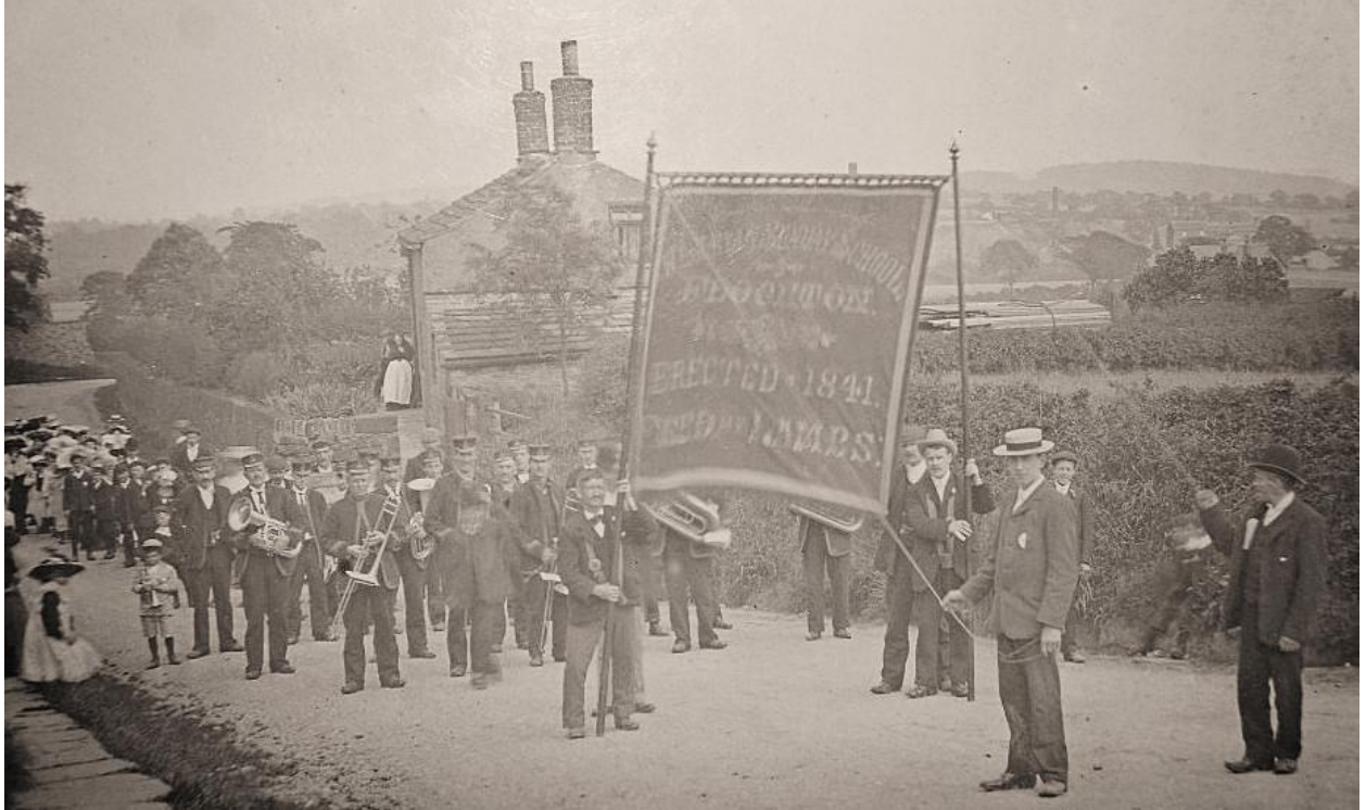
Flockton Brass Band leading the Flockton Sunday School parade, early 1900's

• 13 April 1901 – the band entertained the crowds at the Rockwood Hunt Steeplechases between the meeting's events.