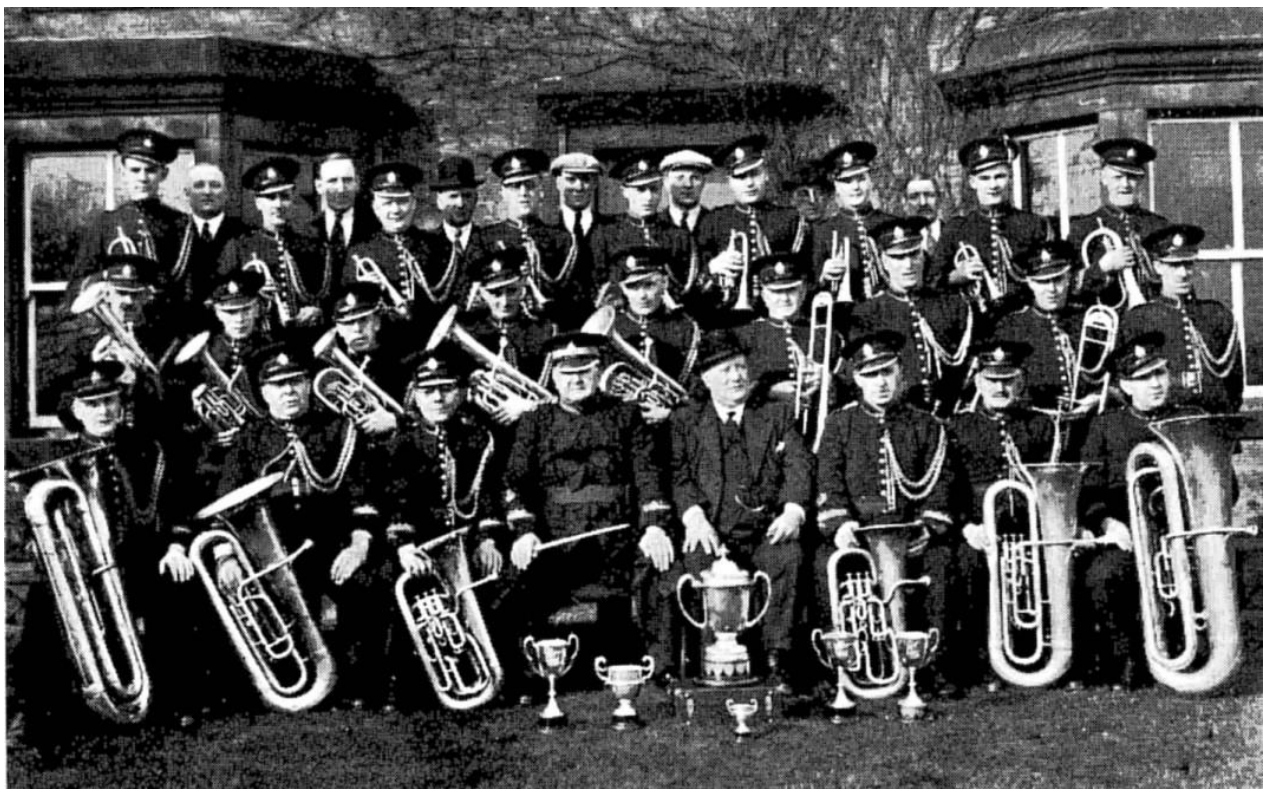
Flockton United Brass Band, 1938