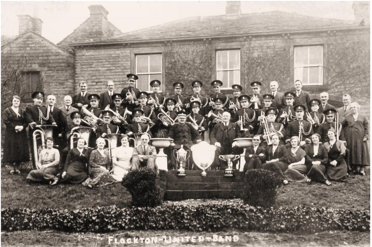
Flockton United Brass Band, 1935, with the Ladies' Committee