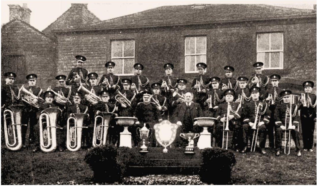
Flockton United Brass Band, 1935