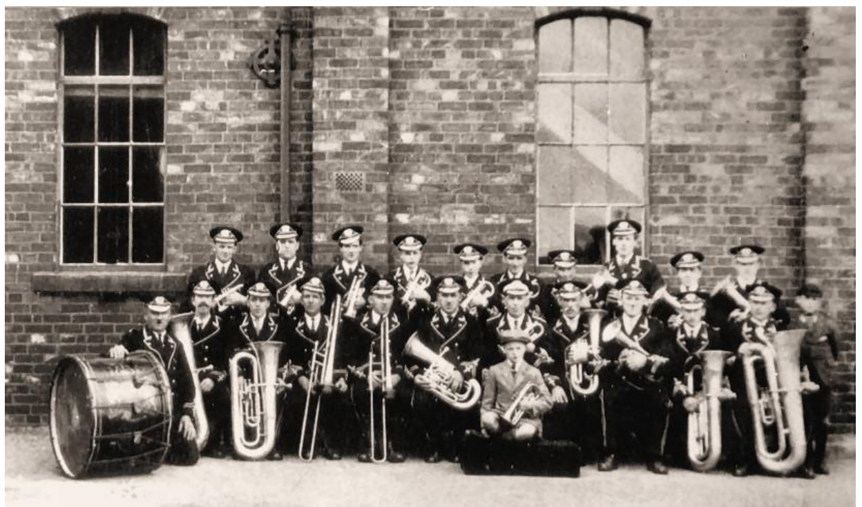
Flockton United Brass Band, 1925

There is a gap in the record of the band from 1912 to 1933 – all that is known is a single photograph, dated 1925.