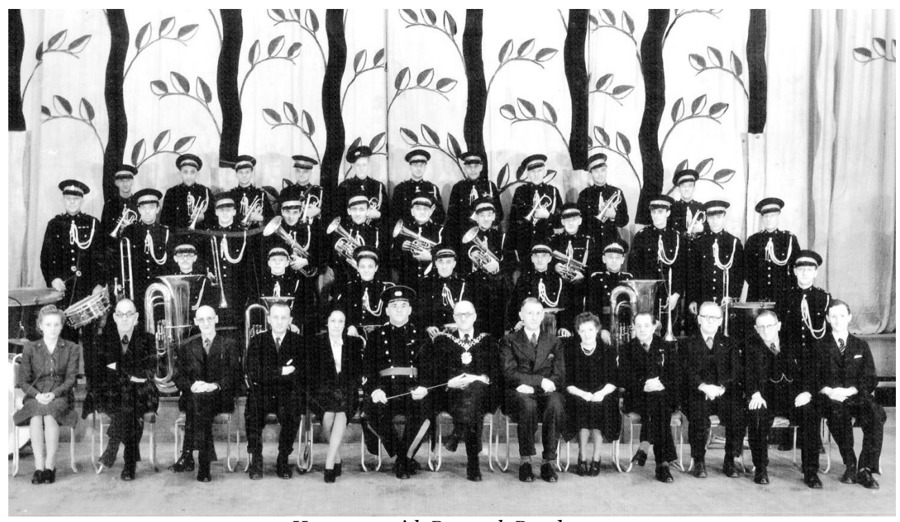
Hammersmith Borough Band, 1947

• On VE Day Shepherds Bush Green was filled with people listening to the Hammersmith Borough Band, which put together a programme of music to entertain the celebrating local population.