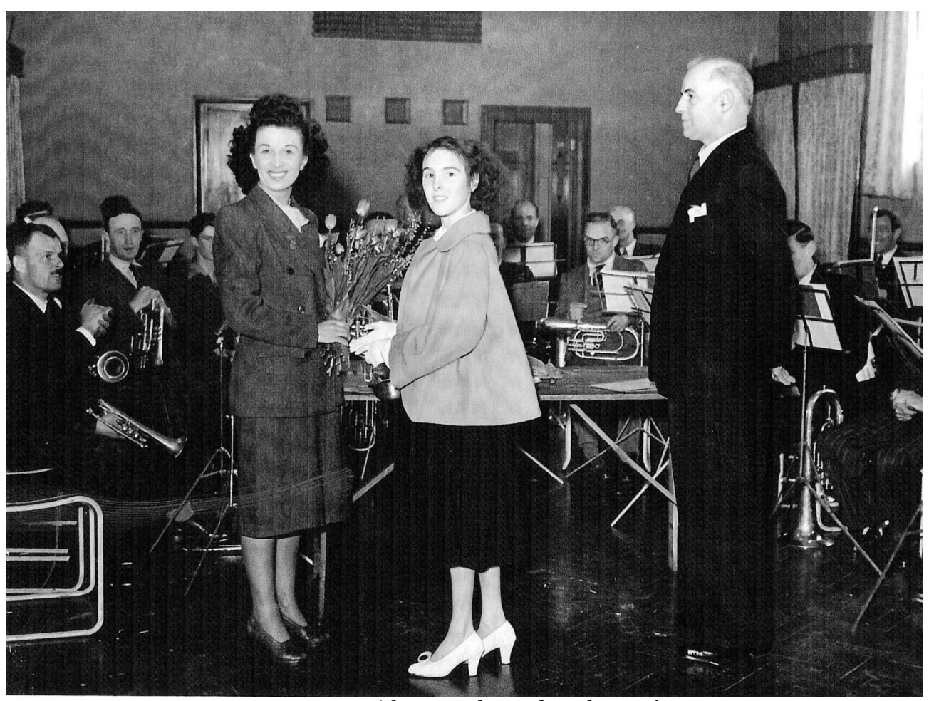
Hammersmith Borough Band, early 1950's