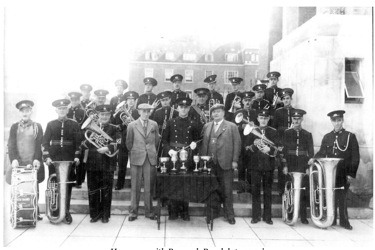
Hammersmith Borough Band, late 1940's

At a concert on 12 December 1949 at Hammersmith Town Hall, with the London Light Opera Society, the band had to play their joint music with the choir a full tone higher than what was printed, to suit the choir – at one day's notice!