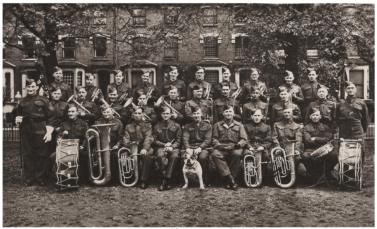
Hammersmith Home Guard Band