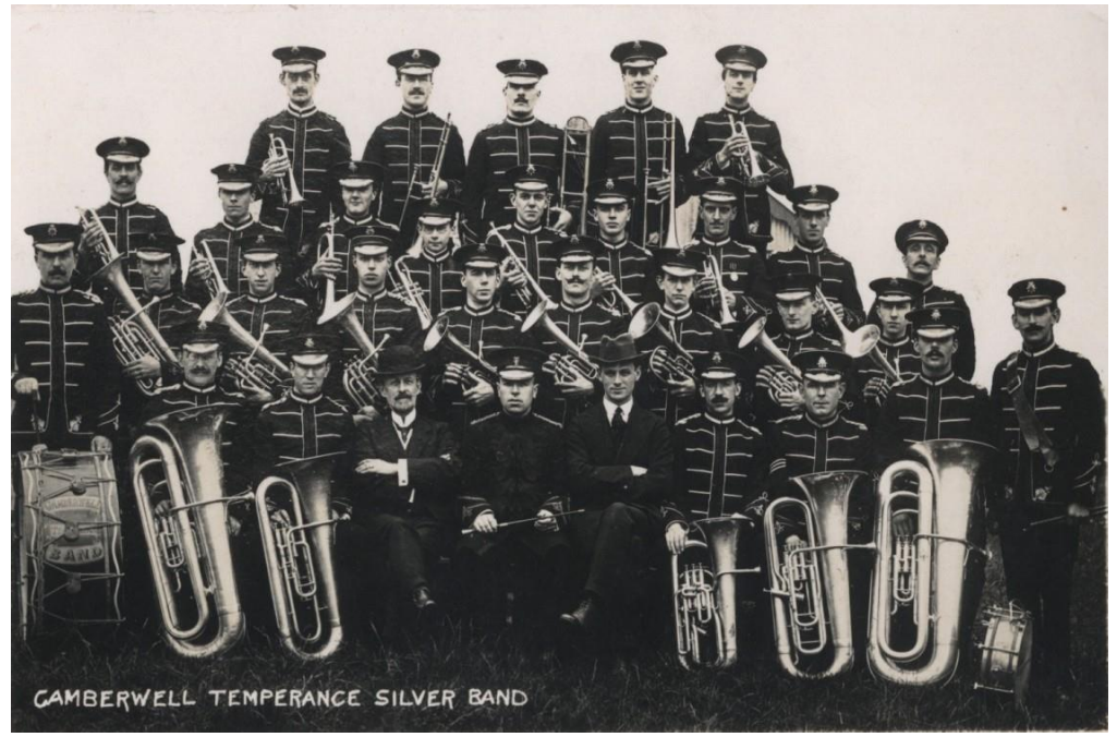
Camberwell Temperance Silver Band

• Camberwell Temperance Silver Band - Active in 1899 through to WW1. Possibly associated with the Camberwell Temperance Lodge of the Phoenix Order, which itself was active in the 1890's. It performed in Maryon Park, Woolwich on Sunday 30 Mary 1909; Ruskin Park, Denmark Hill on Saturday 12 June 1909; Vauxhall Park on Saturday 25 June 1910; South Park, Fulham on Sunday 3 July 1910 and Sunday 7 August 1910; Clapham Common every Sunday at 11.30 a.m. from Sunday 3 May 1914 until the late summer of 1914.