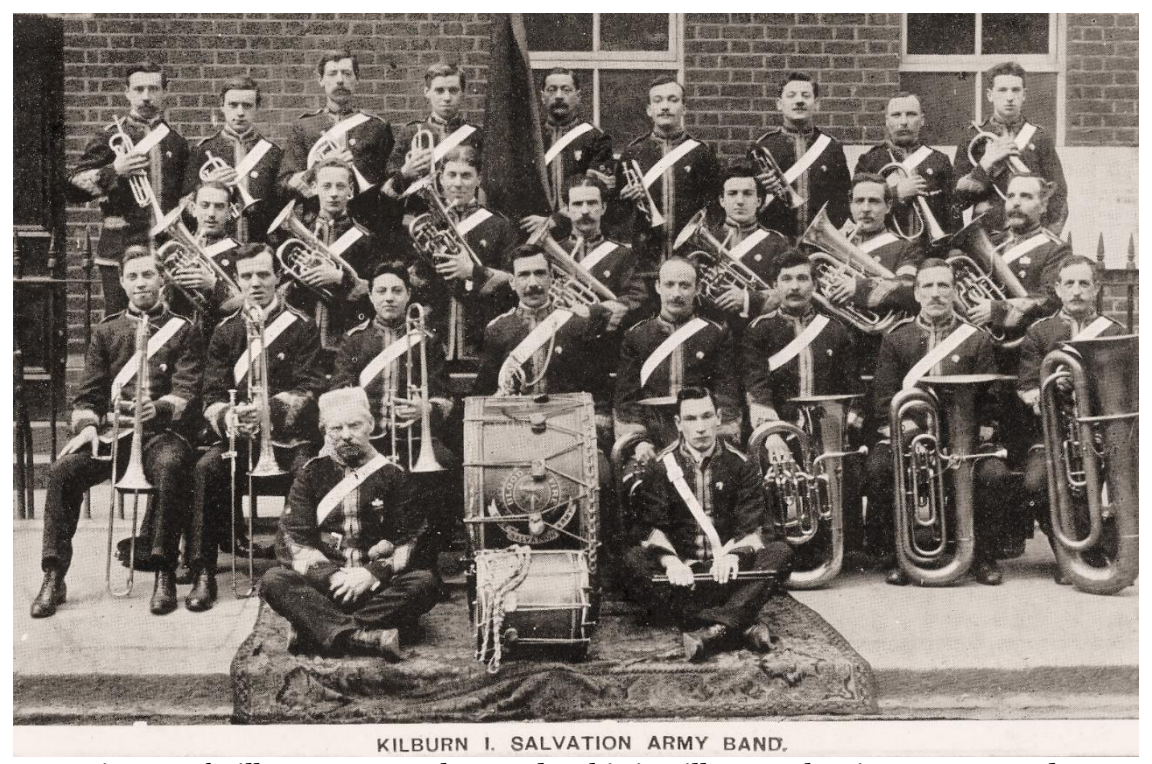
No picture of Kilburn Gas Works Band – this is Kilburn Salvation Army Band