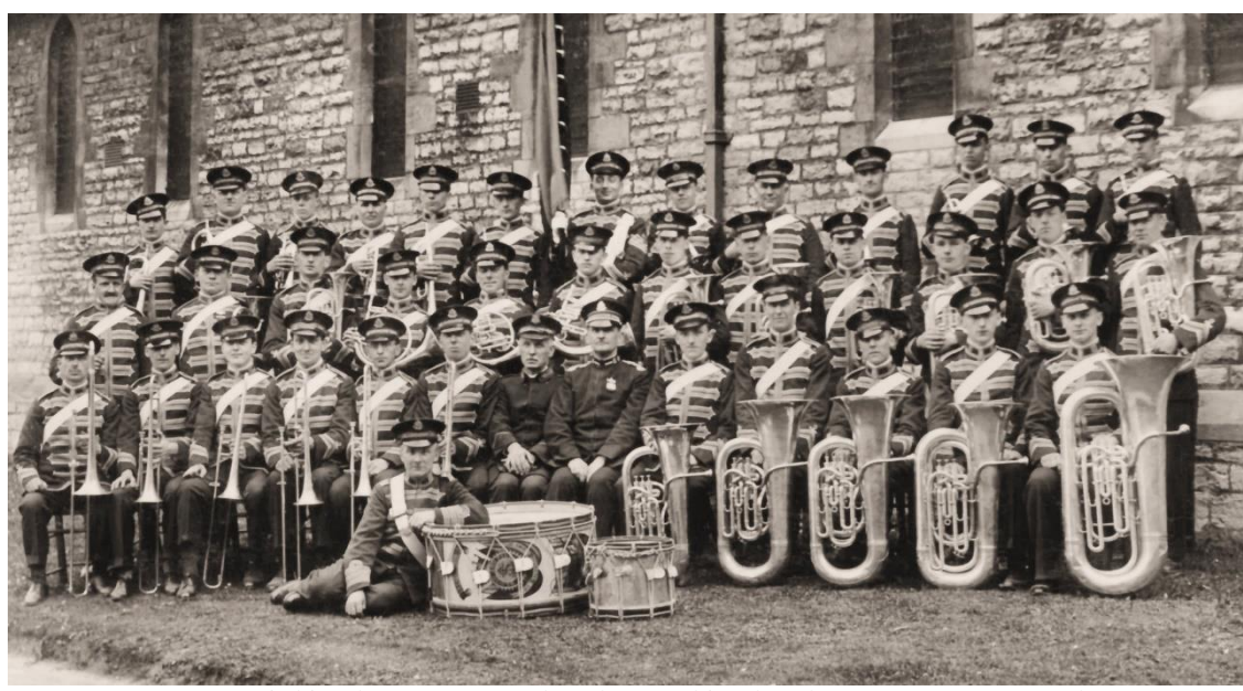
No picture of Ilford Horns Band – this is Ilford Salvation Army Band