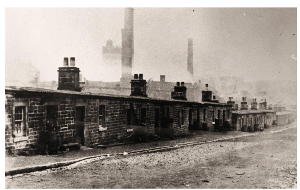
Workers' cottages in Flat Row behind the iron works