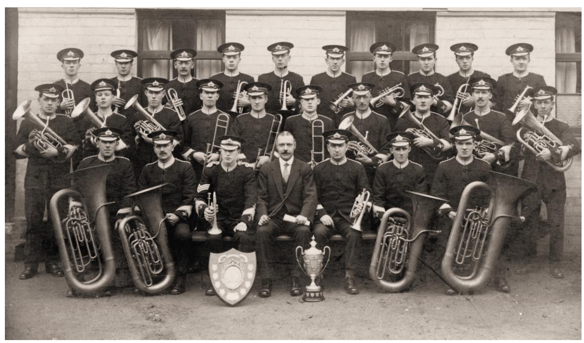
Shotts Foundry Brass Band

The Shotts Iron Works was established in 1801. Large amounts of coal, ironstone and lime in the Shotts area enabled the mass production of pig iron. The iron works and associated mines were the main source of industry in Shotts for over 150 years.