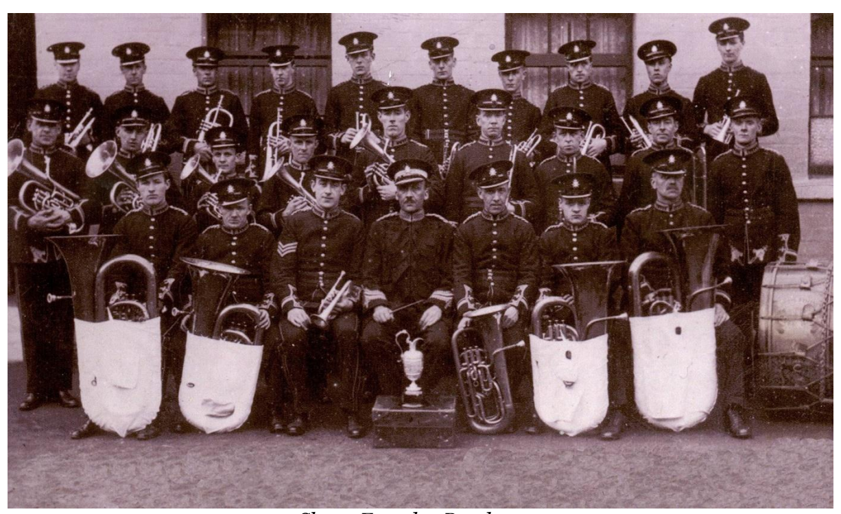
Shotts Foundry Band, 1933