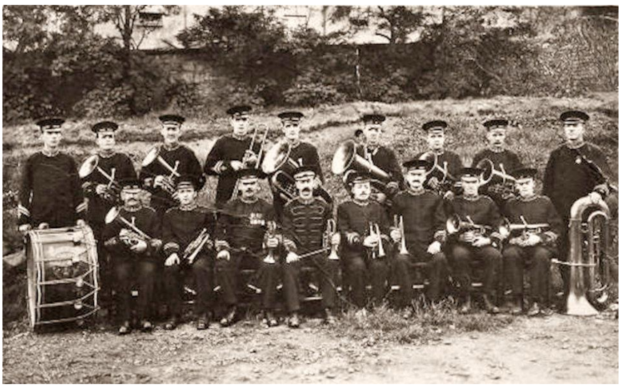
Edinburgh Royal Blind Asylum Brass Band