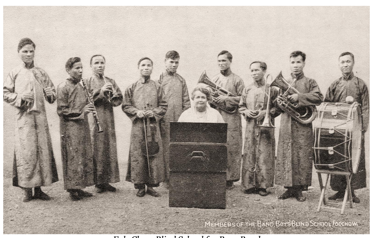
Fuh-Chow Blind School for Boys Band