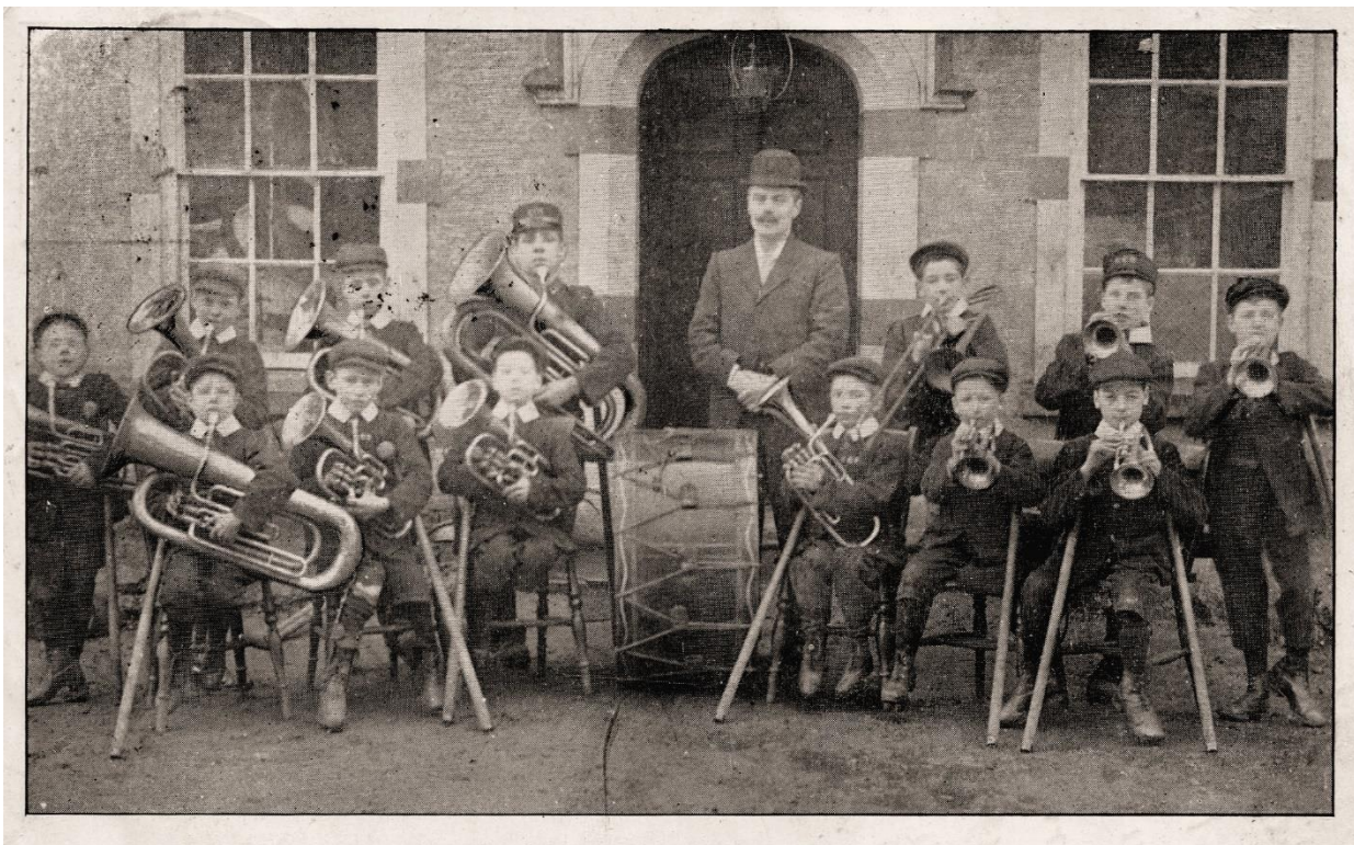
The Only Crippled Children's Brass Band in the World!

• Blackpool and Fylde Blind Brass Band (1) - Active around 1910