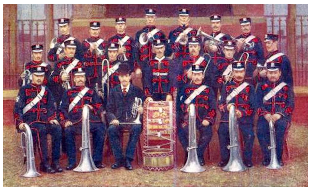
Royal Asylum for the Blind Brass Band, Glasgow

A number of bands were established – rather few compared to those of able-bodied institutions but, given the additional challenges the players and organisers faced in learning and performing music, this is perhaps not surprising. An additional bonus for some bands was the ability to raise funds for their institution through their playing. Most of these bands were associated with schools or institutes for the blind.