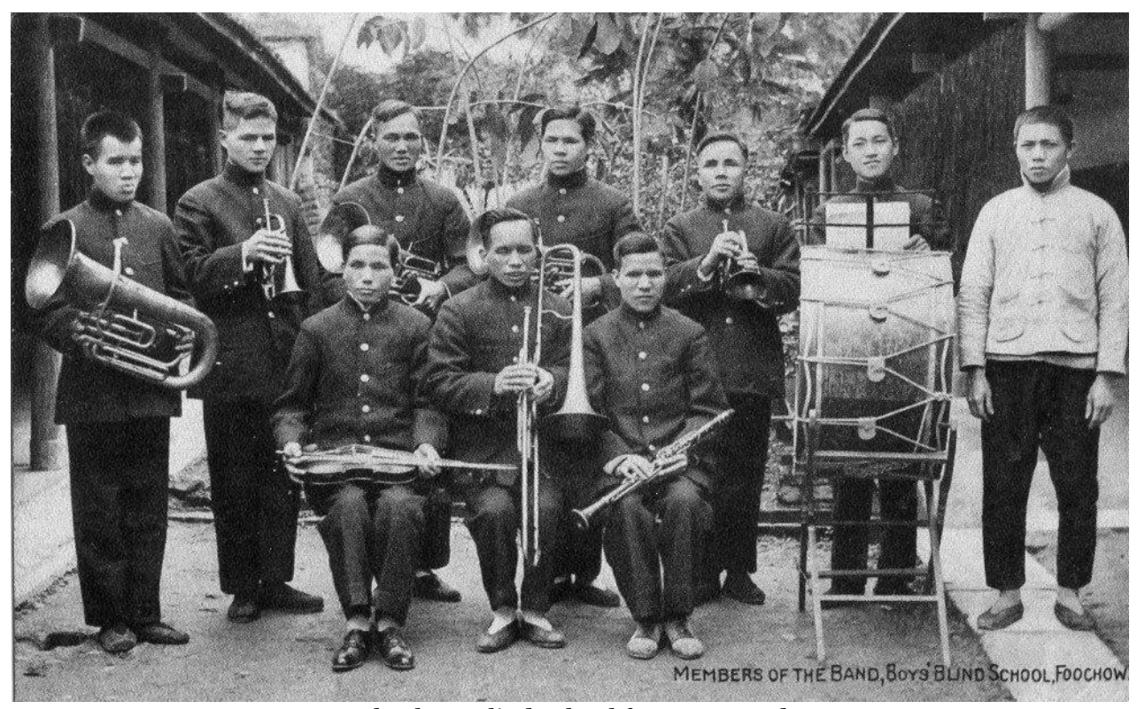
Fuh-Chow Blind School for Boys Band