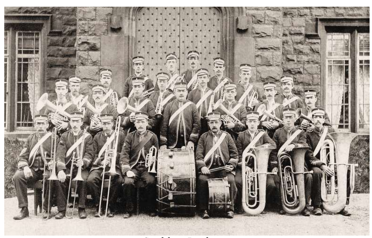
Goodshaw Band, 1903

In introducing the following to its many readers the writer has endeavoured so far as possible and to the best of his ability to meet the requirements and expressed desires of hundreds of true lovers of music amongst both the classes and the masses throughout the whole district and county. It is no easy task to bring all things from memory, but what with interviews with old and aged members, and much having been derived from direct personal experience, compiling and chronicling events and incidents for years past, yet nevertheless we have the gratification of being able to place before the public a reading calculated is in every subject to be interesting and undoubtedly useful to its several admirers. For a sequel to the Origin and success of the Goodshaw Band having become loud and importunate to be resisted, the pleasant task of writing it is purely and simply one of love, therefore should it prove the humble instrument of transposing into the minds of any organisation and may some portion of that sublime spirit of emulation which glows in the heroes of our text, and in the memories of the old members who are still living, and yet having a remembrance of those who have passed away, the writer will consider himself abundantly compensated for his task.