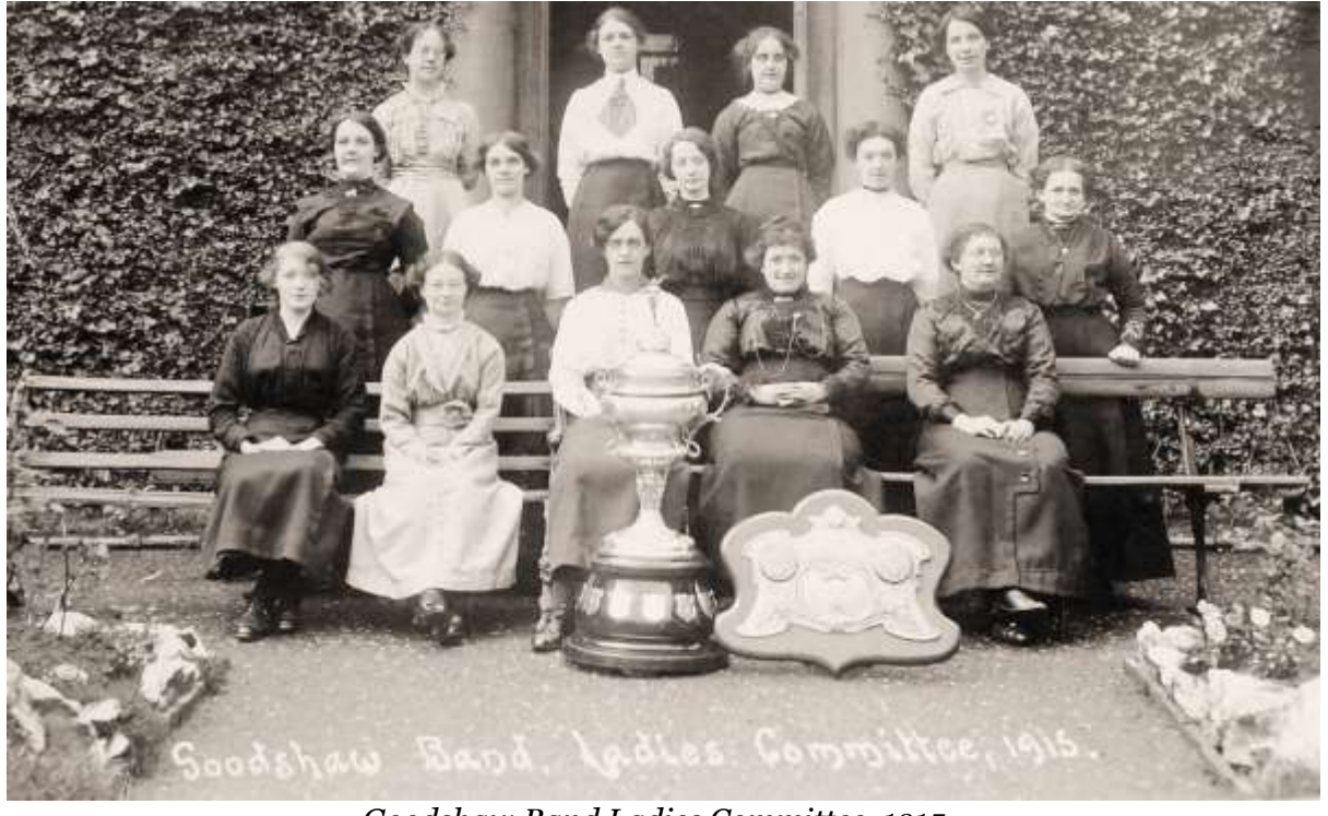
Goodshaw Band Ladies Committee, 1915