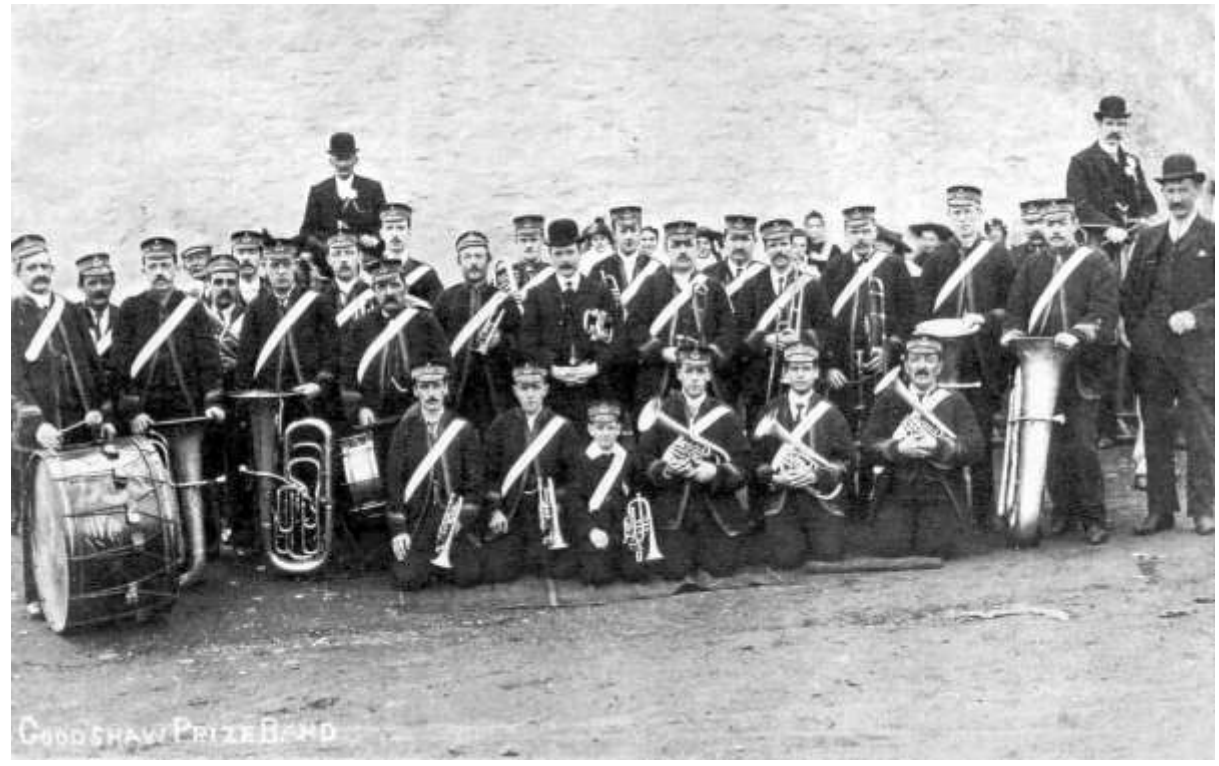
Goodshaw Band, 1904