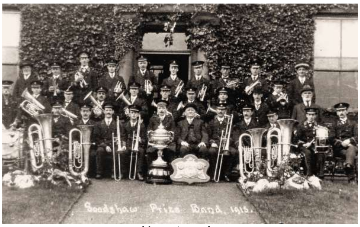
Goodshaw Prize Band, 1915