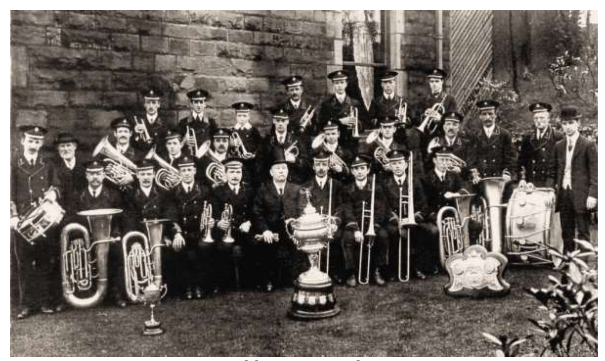
Goodshaw Brass Band, 1912

they were all getting a good lunch and preparing for home, who should come but some of the Accrington Old bandsmen, who gave them a little encouragement to persevere and stick together and, after they had played a piece for them, they made for home, having got rather late and dark and raining, and over that hill to come and played all that sound was no mean task.