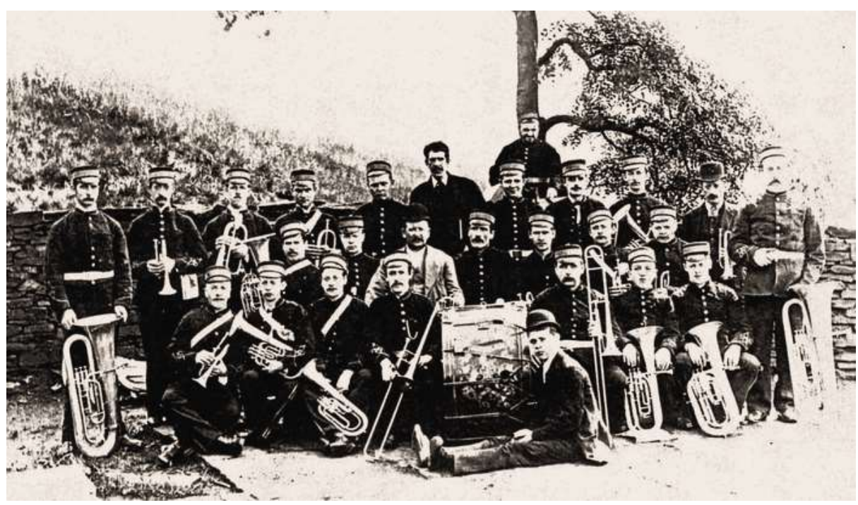
Goodshaw Band, 1893

Having spent the winter in practising these and other pieces and the spring coming round, this was a very humorous task, that was learning to march. To practice they went on to the hills, there being a pretty level field which is known by the name of the Lots, which is on the road leading from Love Clough to Accrington. And by going across the field and back a few times their lips soon began to give way, they not being used to playing and marching, and on retiring came into the village and agreed to play in for the first time which was quite amusing, some getting across the bridge a yard or so in front of the others, and not being able to play to their headquarters had to make a circle besides the well, the road leading up to the band room being rough and steep, and which all the old villagers used to call it Up Nook, and it was a nook and is yet their band room having been an old coach house, but they did not stay there very long for they removed to the bottom room of the western part of the old Mansion House, being part of one I have mentioned before, the top room being used as a Wesleyan school and chapel, and while having this room they got on very well as far as playing was concerned and they commenced getting engagements.