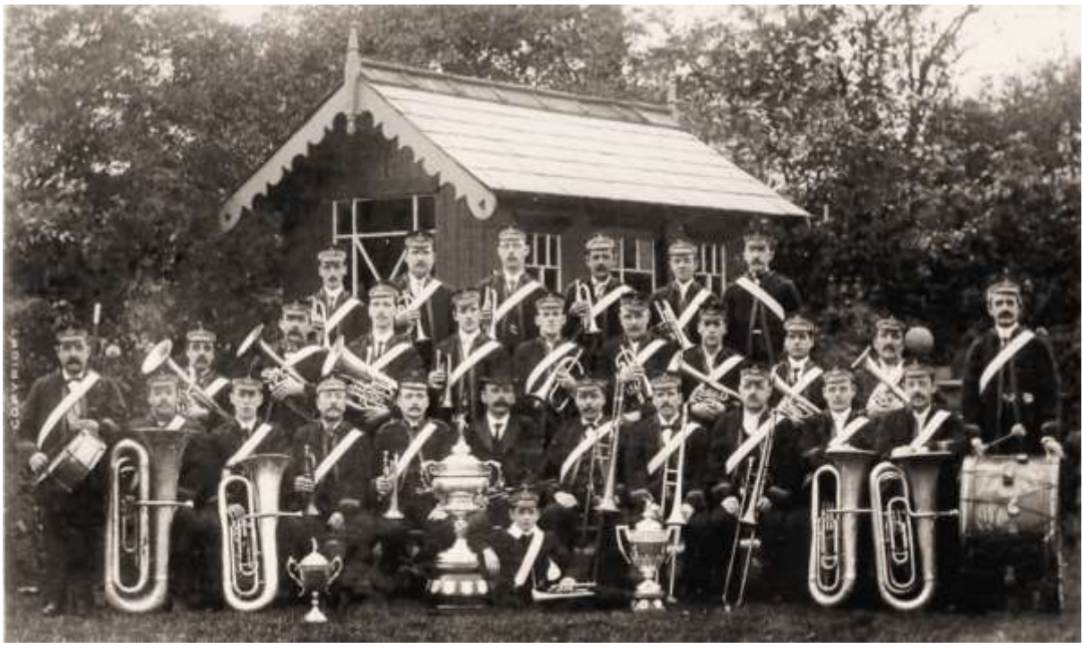
Goodshaw Brass Band, 1906