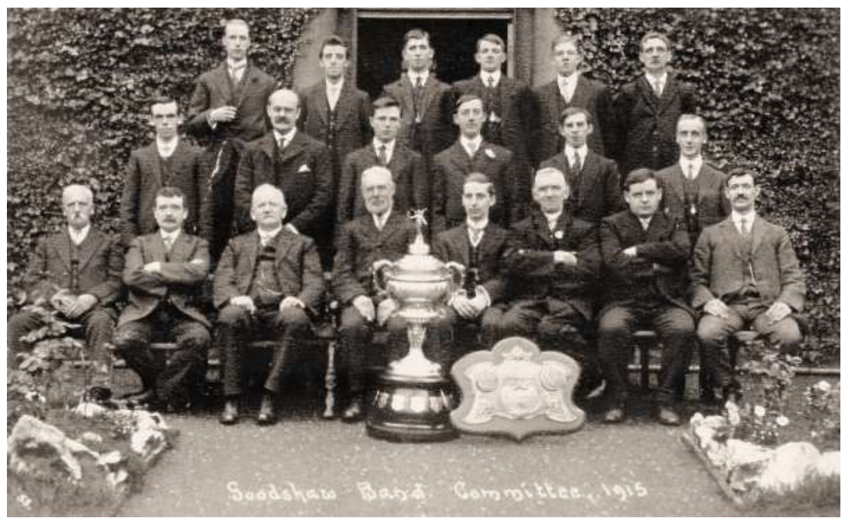
Goodshaw Band Committee, 1915