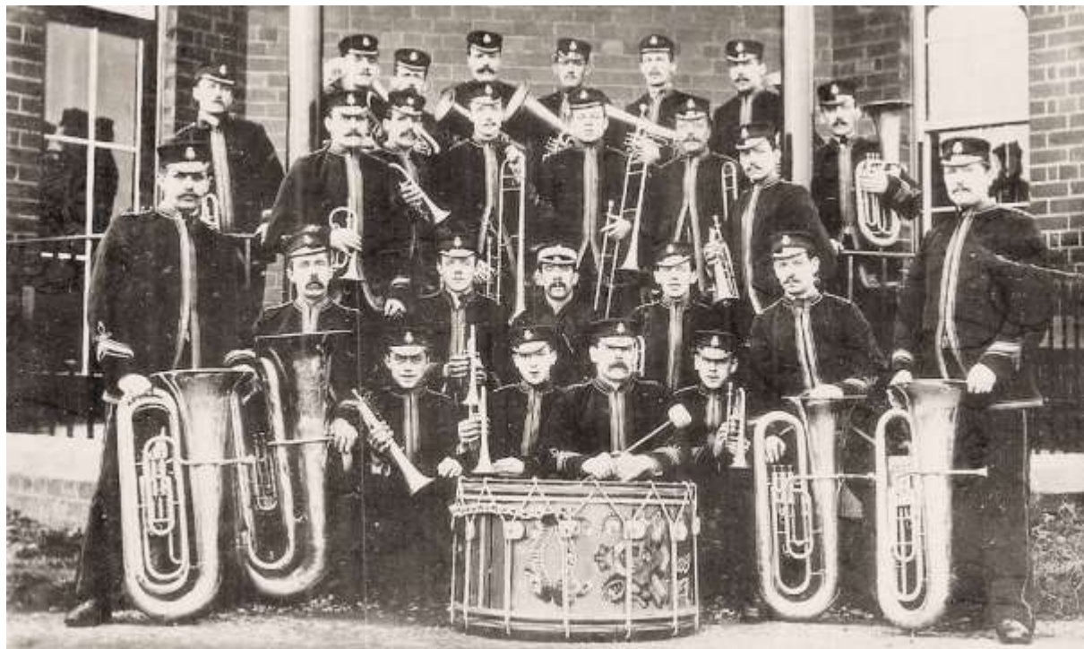
Rothwell Temperance Band 1903