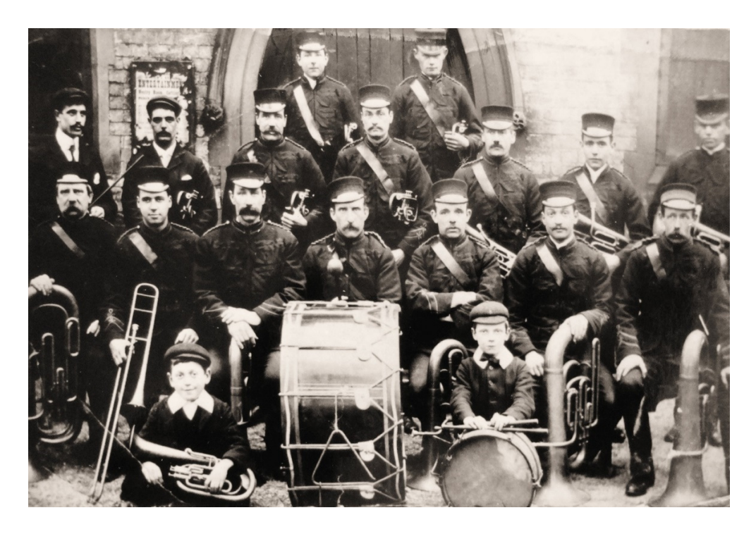
Cottingham Brass Band