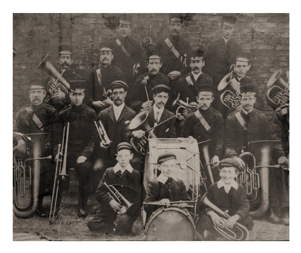
Cottingham Brass Band