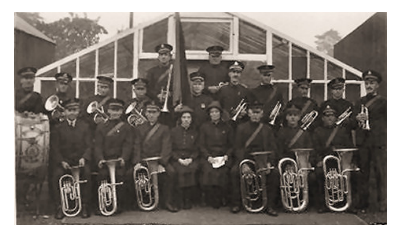
Cottingham Salvation Army Brass Band – 1931