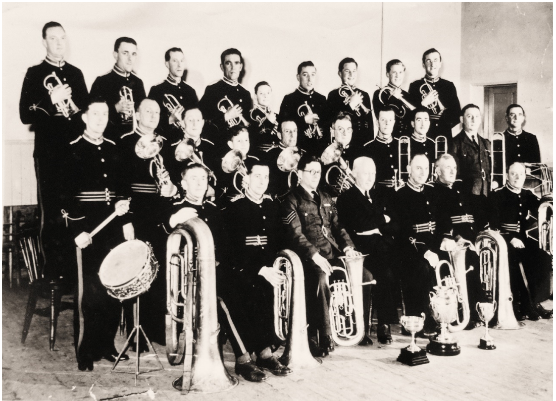
Cottingham Brass Band – 1946