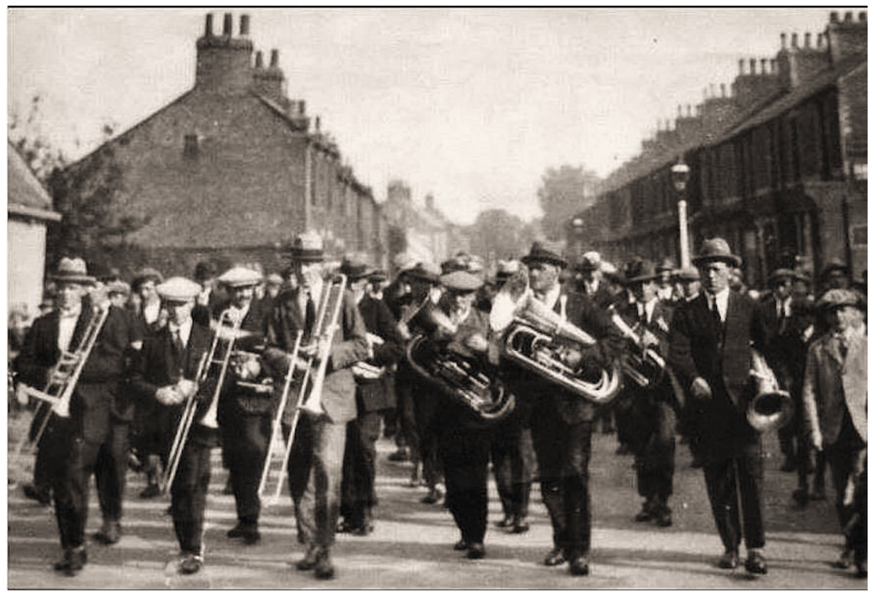
Cottingham Brass Band – 1922