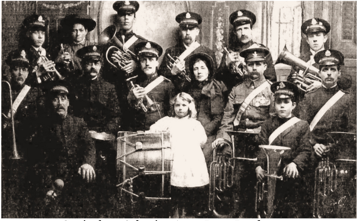
Cottingham Salvation Army Brass Band – 1915