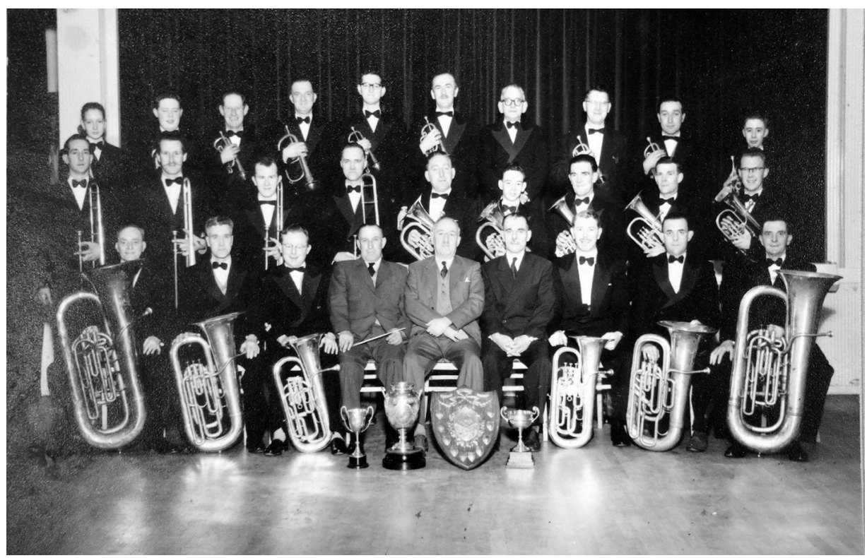
Cottingham Brass Band – 1959