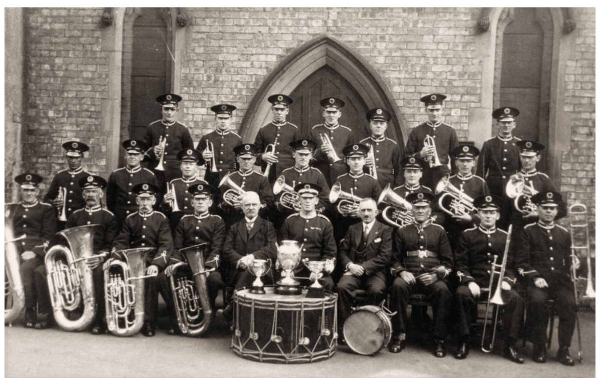
Cottingham Brass Band