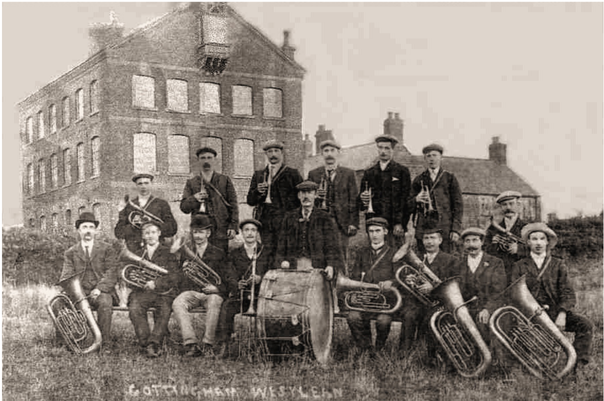
Cottingham Wesleyan Brass Band – in front of Wallis & Linnell's Clothing Factory