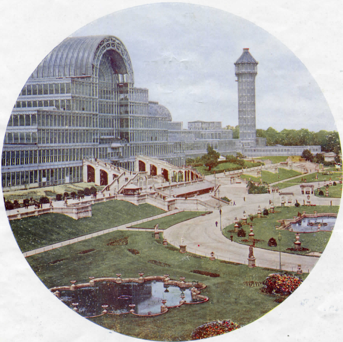
THE CRYSTAL PALACE THE LARGEST EXHIBITION BUILDING IN THE WORLD