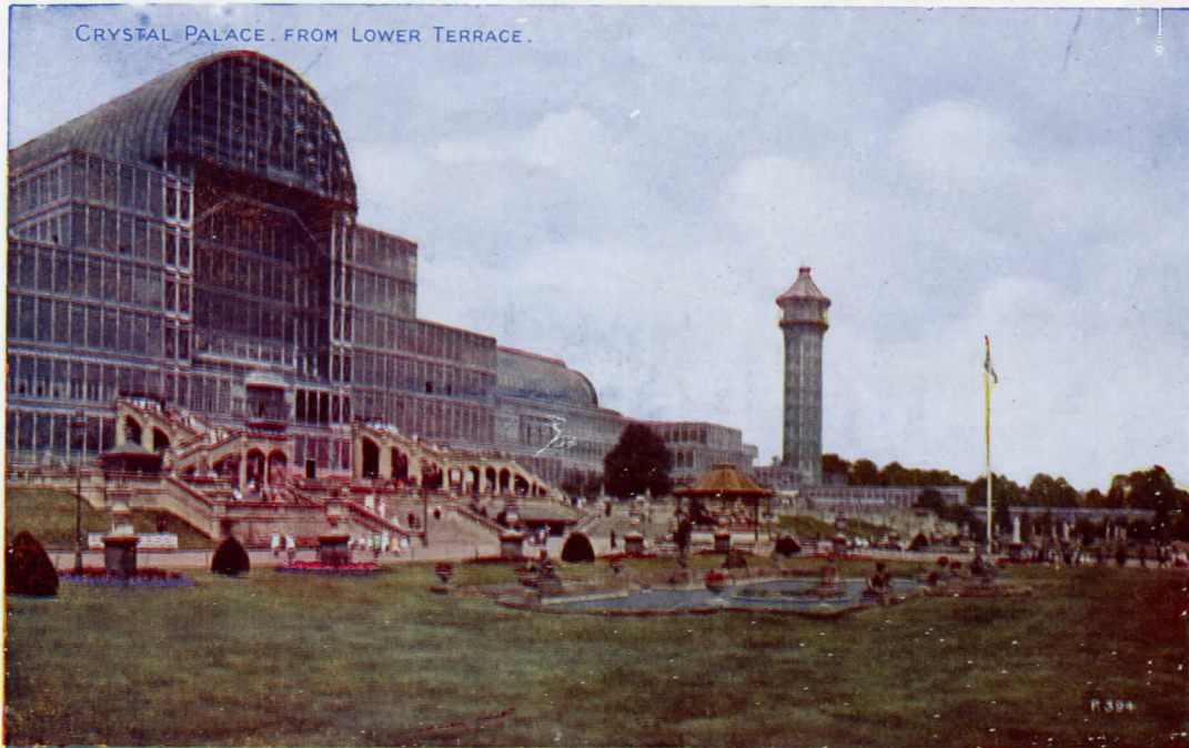
CRYSTAL PALACE, FROM LOWER TERRACE.