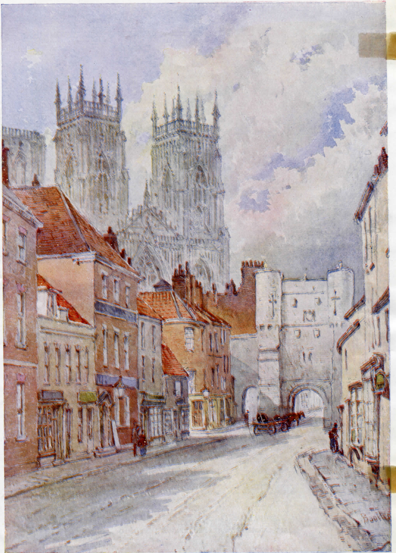
BOOTHAM AND ITS BAR, YORK