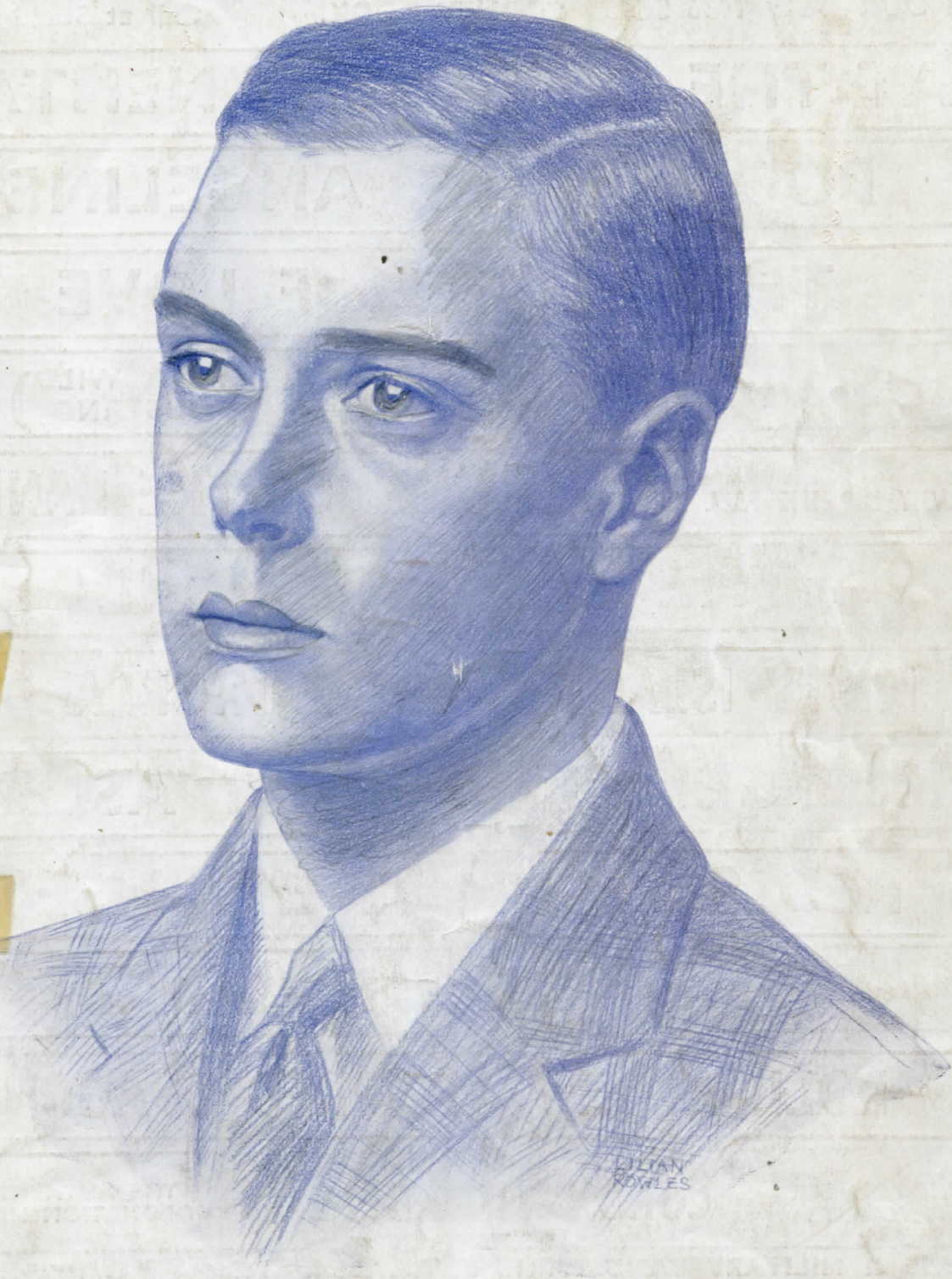
OUR GRACIOUS PATRON, HIS MAJESTY KING EDWARD VIII

PROGRAMME AND SOUVENIR OF THE CRYSTAL PALACE FULL LIST OF BANDS