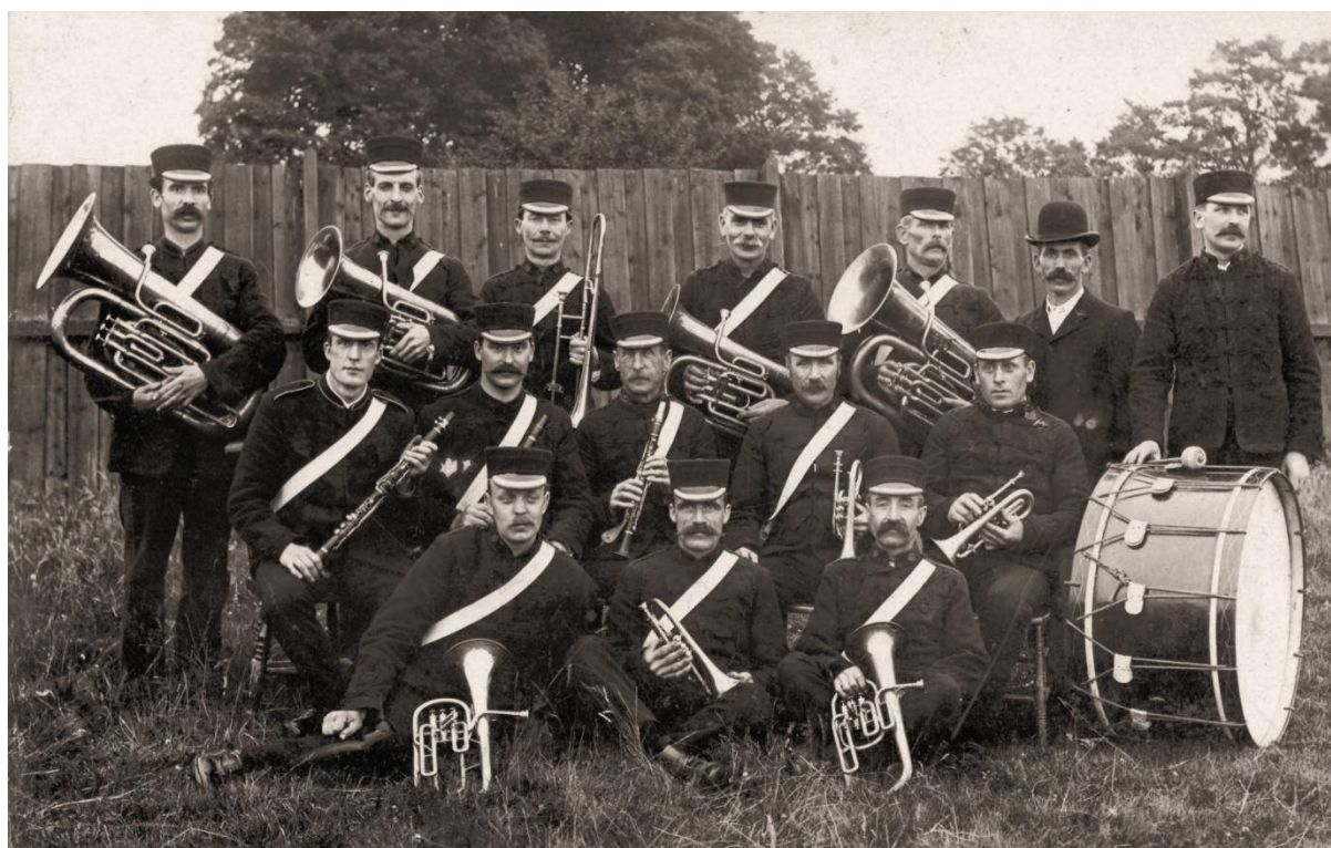
Greenway's Band, Downend

Bristol Centre Brass Band - Active in 1885. Still active in 1887