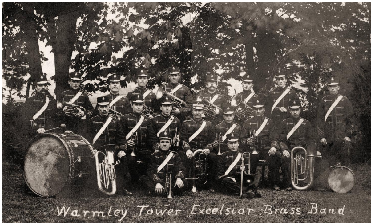
Warmley Tower Excelsior Brass Band

St Luke's Britannia Temperance Brass Band (Bristol) - See: Bristol Britannia Temperance Brass Band