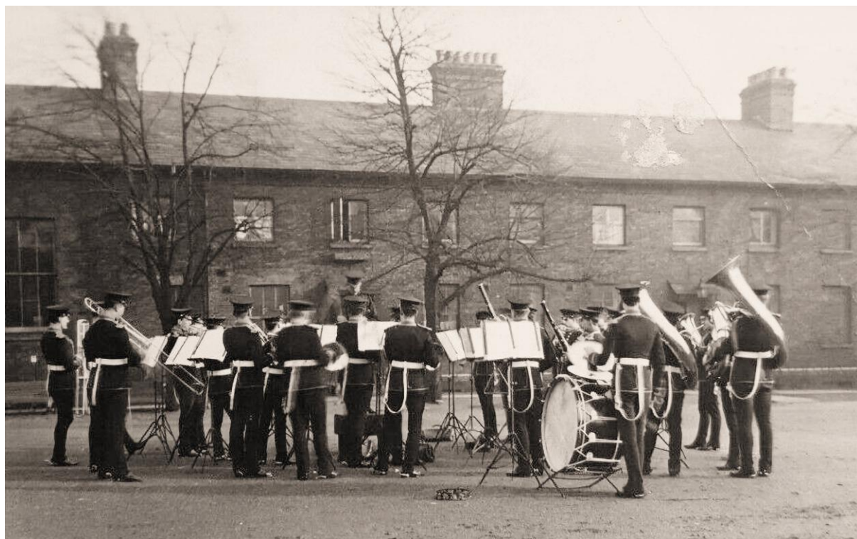
Unknown band, Bristol