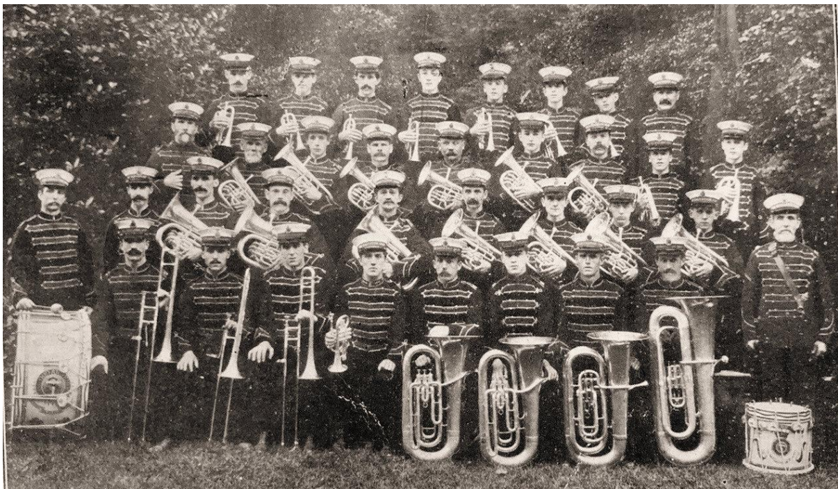
Bristol I Citadel Salvation Army Band

Warmley Mission Reed and Brass Band - See: Warmley Military Band