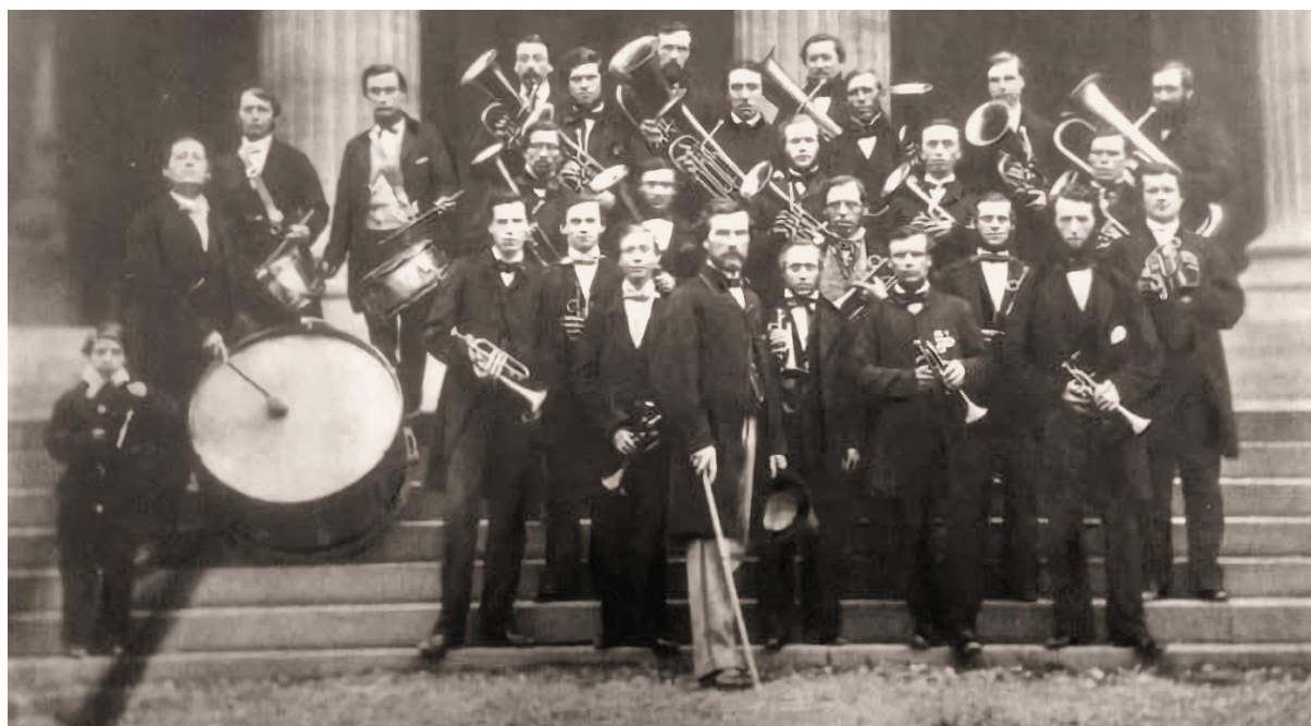
Bristol Gas Company Brass Band