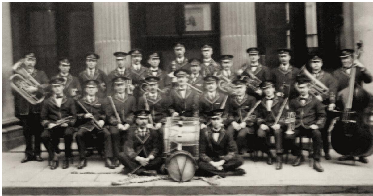
Bristol Post Office Band

Bristol Y.M.C.A. Brotherhood Brass Band - See: Bristol Central Mission Brass Band