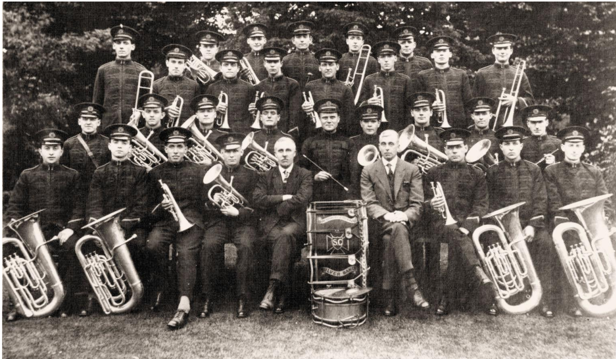
Shaftesbury Crusade Silver Band, Bristol, 1924

Extracted from "Brass Bands of the British Isles 1800-2018 - a historical directory" (2018)