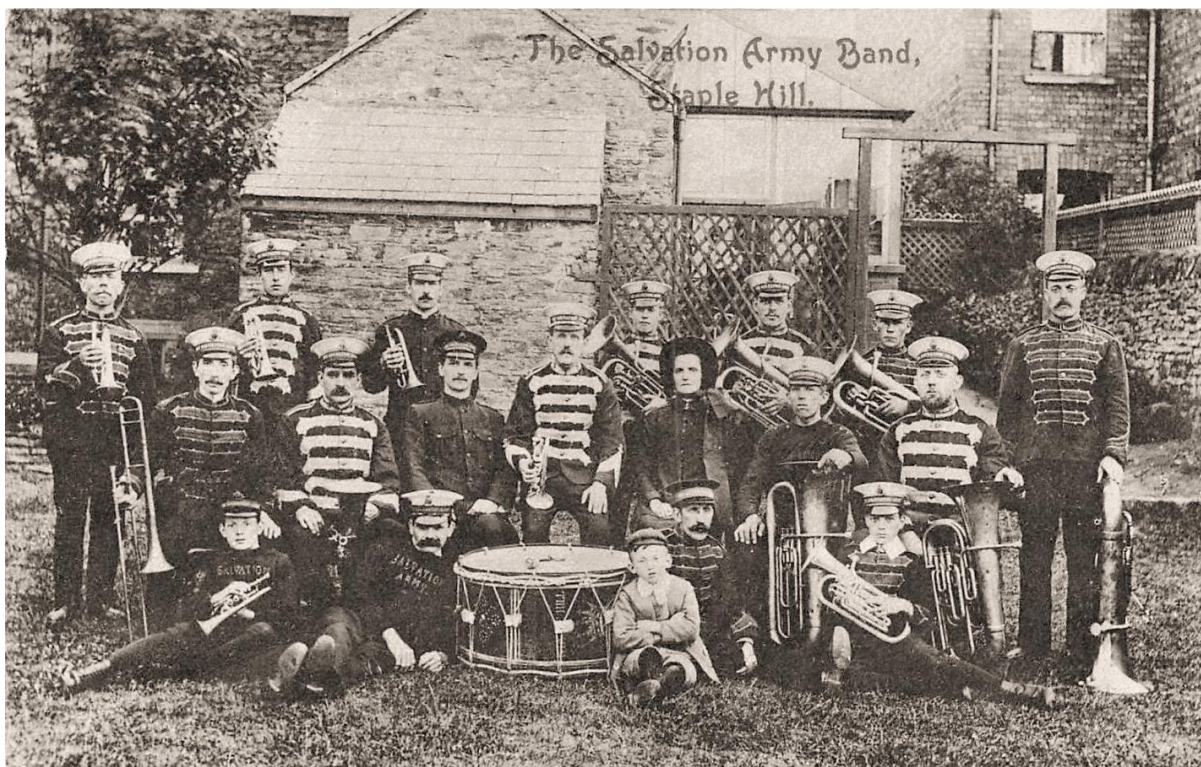
Staple Hill Salvation Army Band

Old King Street Wesleyan Brass Band (Bristol) - See: Bristol Central Mission Brass Band