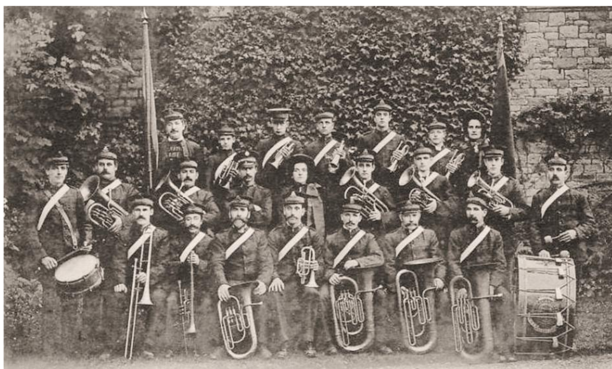
Fishponds Salvation Army Band, 1904