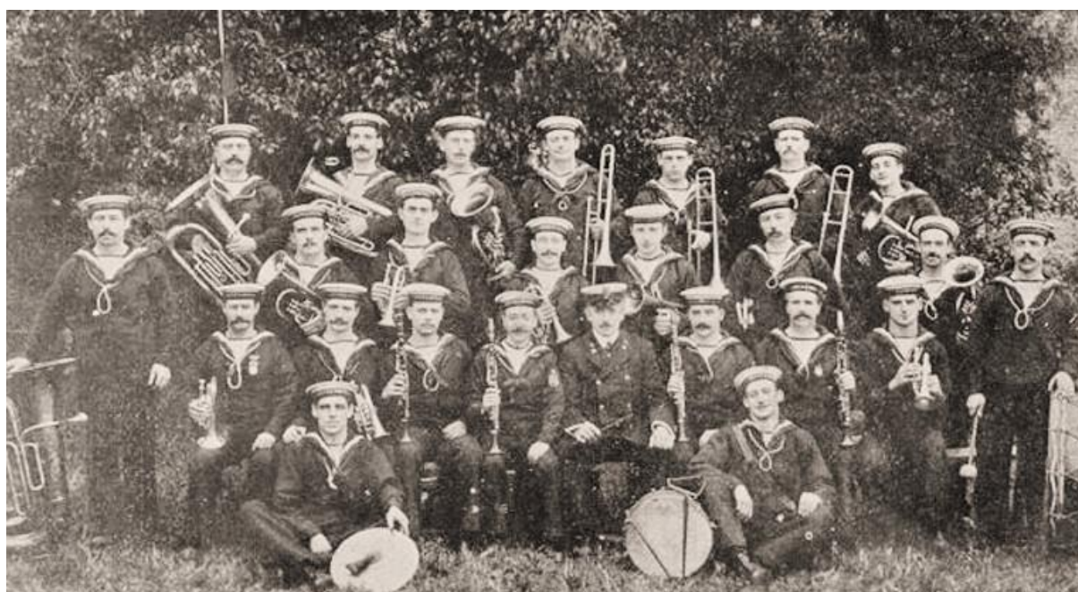
Royal Naval Volunteer Band (Bristol Division)

King Street Wesleyan Bible Class Band (Bristol) - See: Bristol Central Mission Brass Band