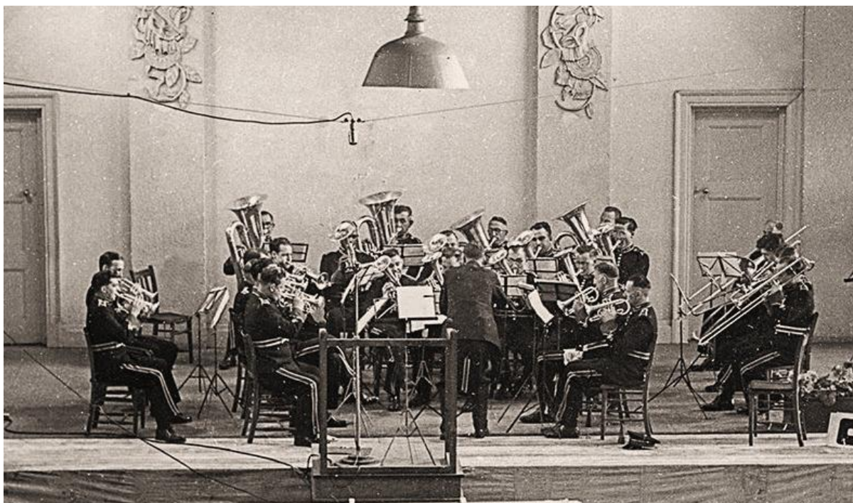
Bristol Aero Works Band, 1952