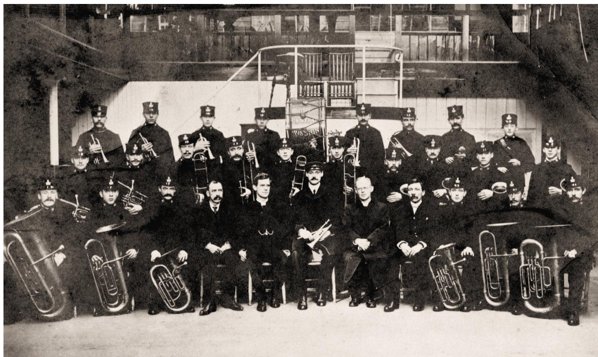
Bristol Central Mission Prize Brass Band