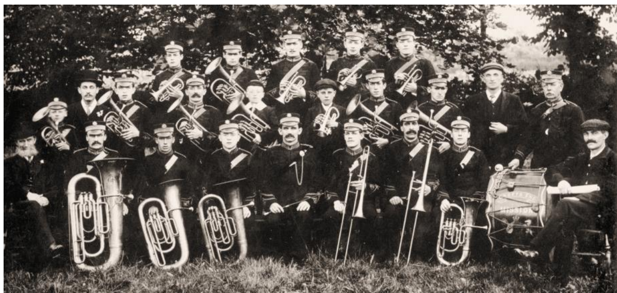
Crofts End Mission Band

Bristol and Exeter Sheds Operatives Brass Band (Bristol) - Active in 1859 to 1864