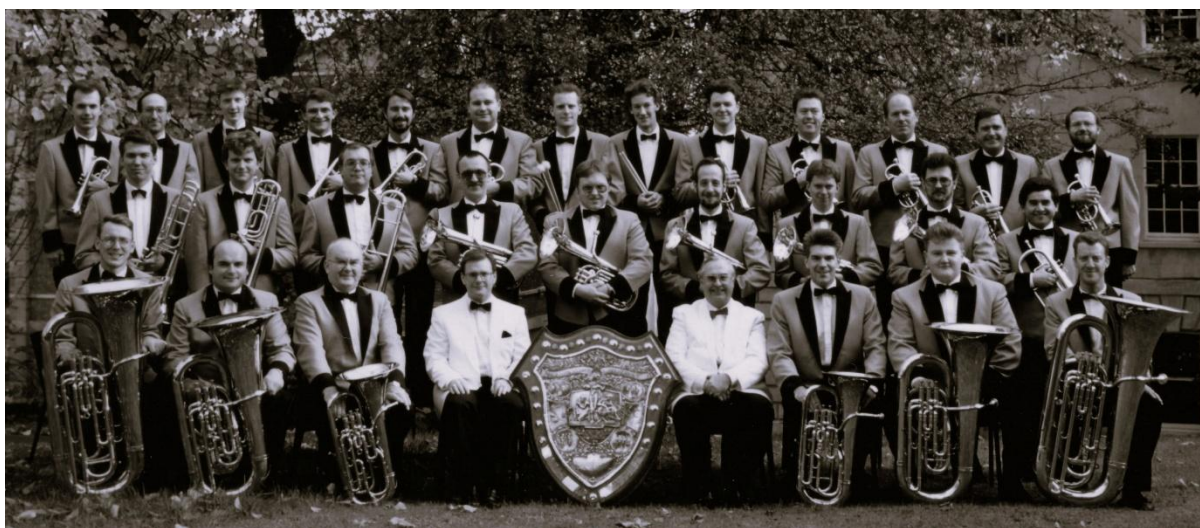
Sunlife Band, Bristol, 1990