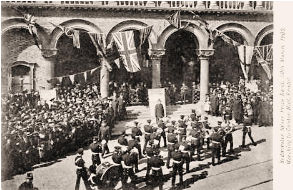
Bedminster Silver Prize Band, Colston Hall, Bristol, 1905

Knowle Brass Band (1) (Bristol) - Active in the early 1890s. Amalgamated with the Windmill Hill Brass Band in early 1898. Known as Knowle Brass Band thereafter