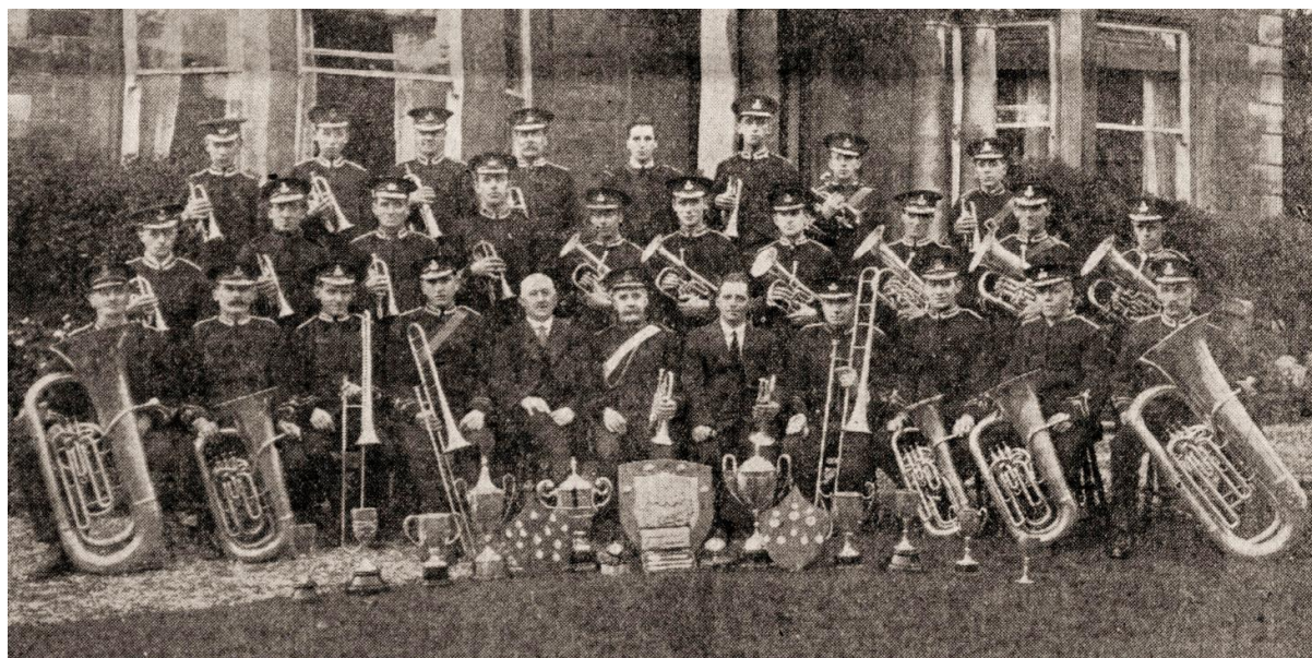
Kingswood Evangel Silver Band, 1922