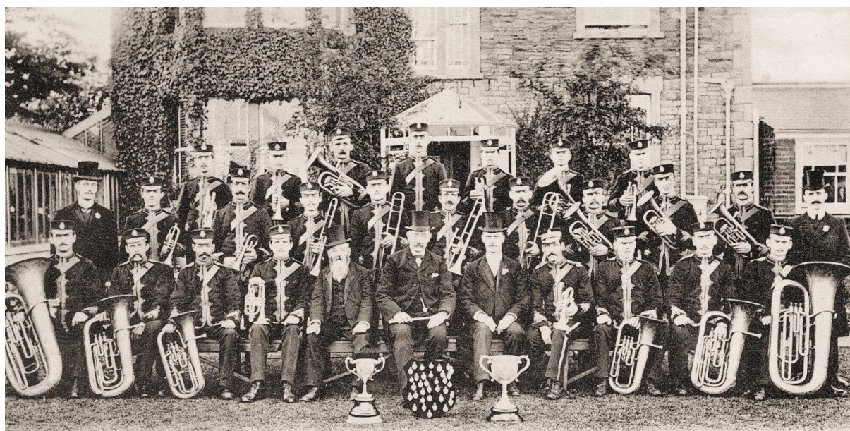
Bristol Imperial Prize Band

Brison and Co.'s Brass Band (Bristol) - See: Messrs Walter and Brison's Brass Band