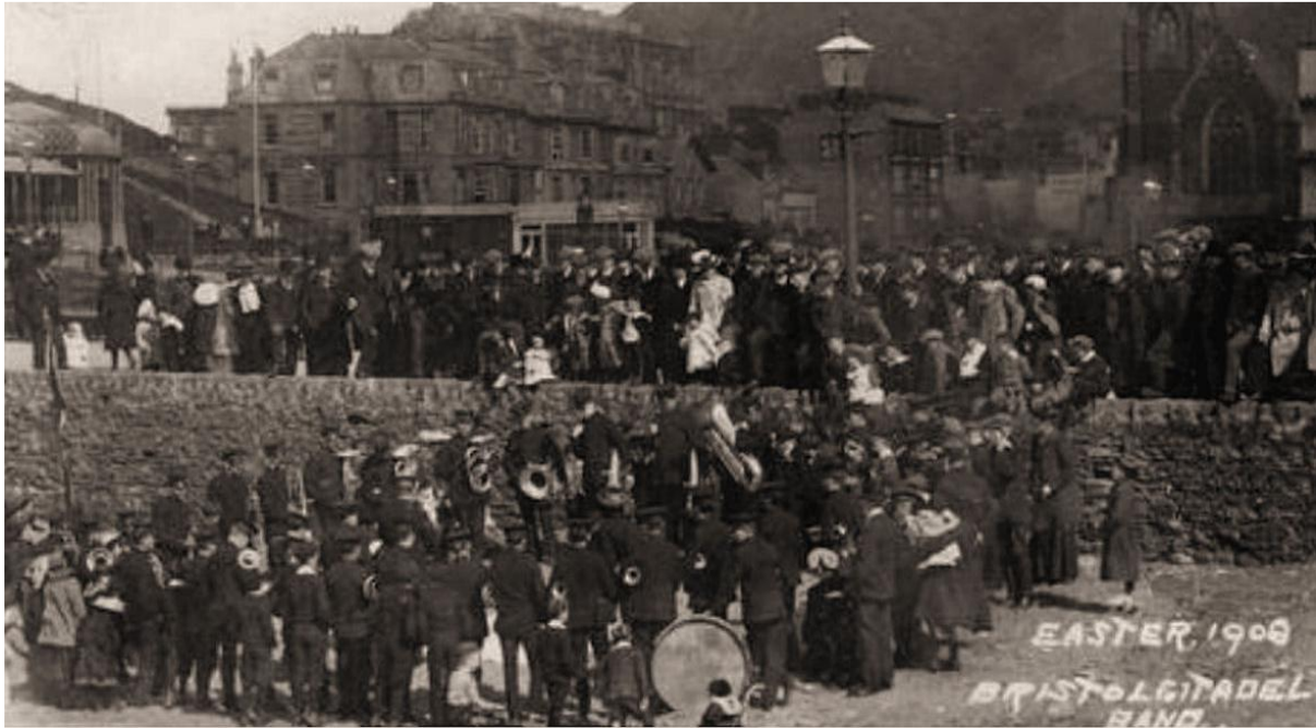
Bristol Citadel Salvation Army Band, Easter 1908

Wellington Road Mission Brass Band (Bristol) - Active in 1891. Still active in 1899