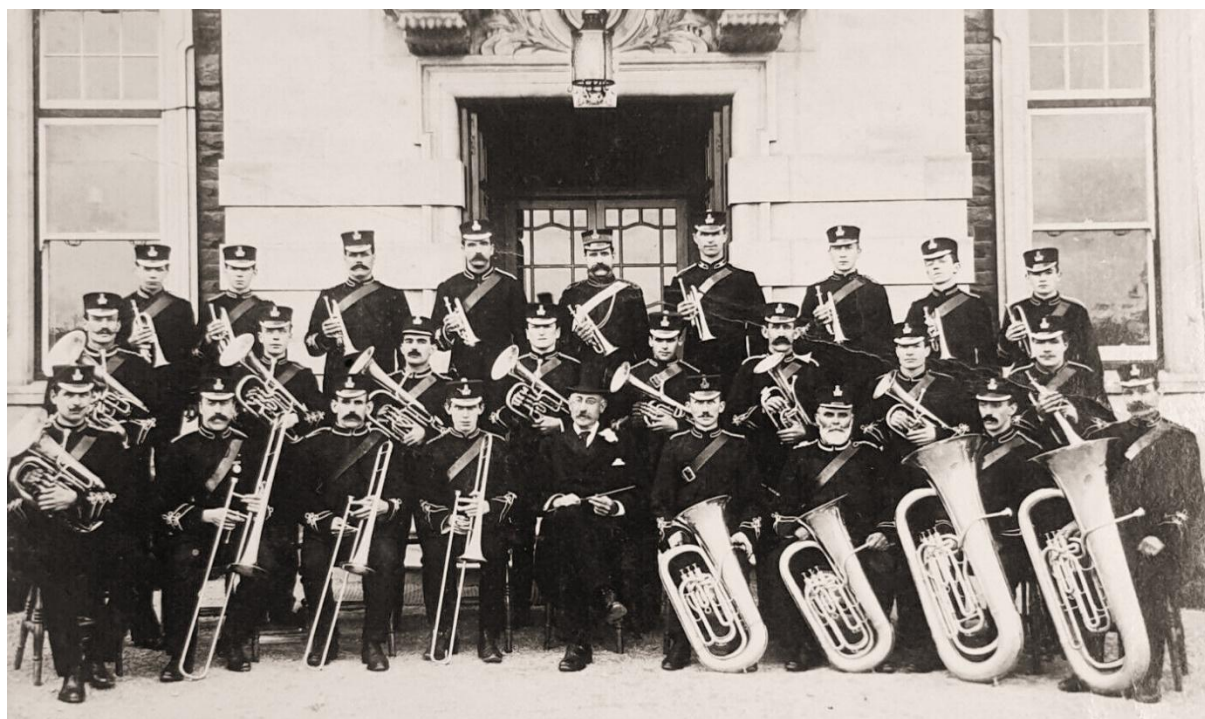
Unknown band, Bristol