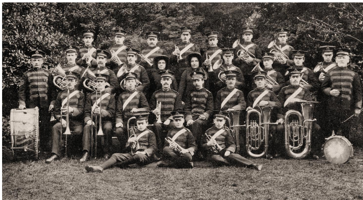
Bristol VI Citadel Salvation Army Band

Redland Brass Band (Bristol) - Founded in 1861, rehearsing at St John's Schoolroom, Durdham Down on Monday evenings, 8 to 10. In 1864 they took part in the processions celebrating the official opening of the Clifton Suspension Bridge in Bristol. Still active in 1868