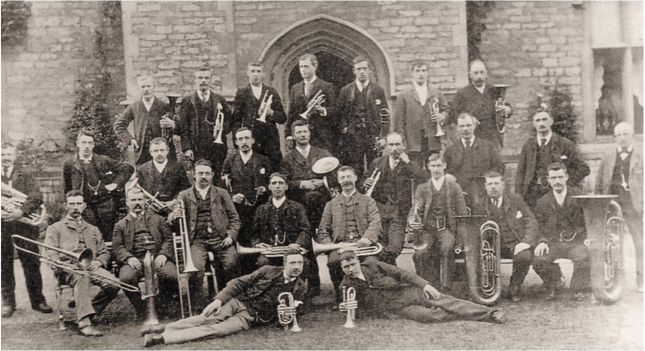
Black Dyke Mills Band, 1893

The following week some of the adjudication remarks for the contest were published: