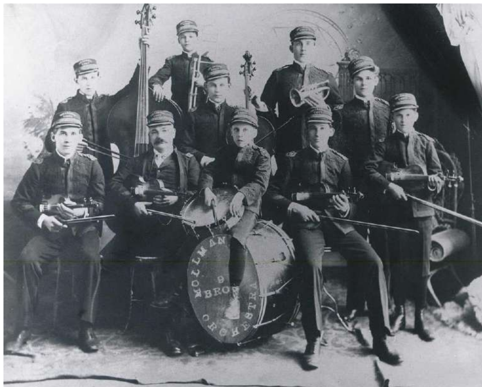
The Mollman Nine Brothers Orchestra, c. 1905

This musical family were not only proficient on brass instruments. Some were also accomplished string players, and the family also performed as the Mollman Nine Brothers Orchestra.