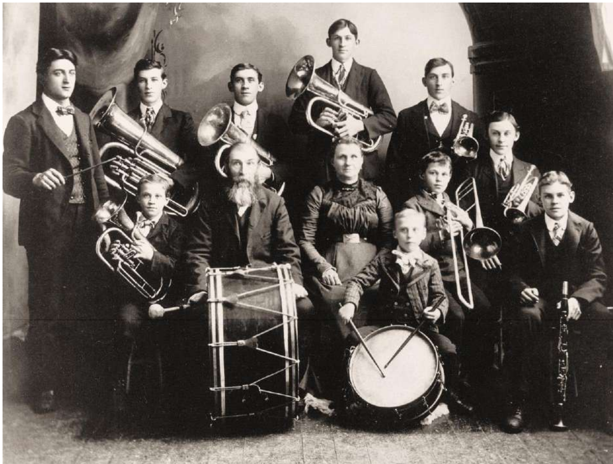
The Mollman Family Band, c. 1900, in Coal City – the conductor is not known