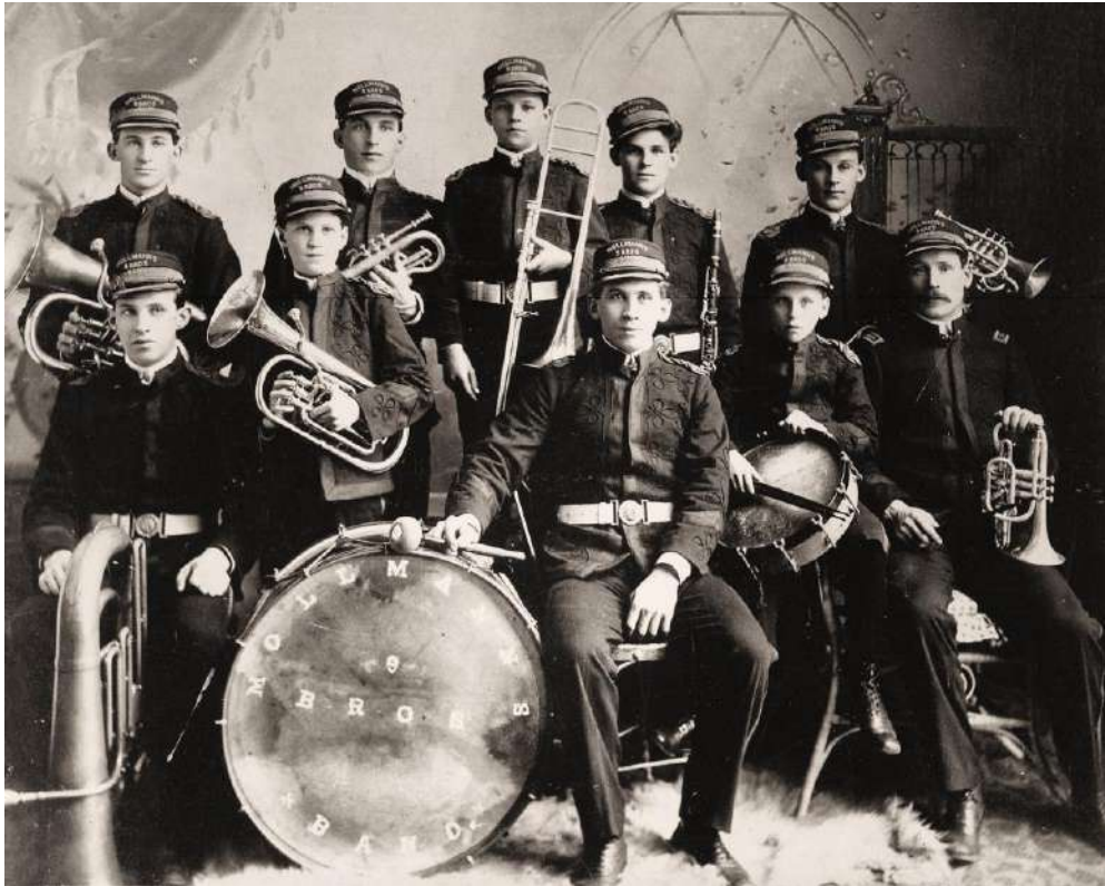
The Mollman Nine Brothers Band, c. 1905

This musical family were not only proficient on brass instruments. Some were also accomplished string players, and the family also performed as the Mollman Nine Brothers Orchestra.