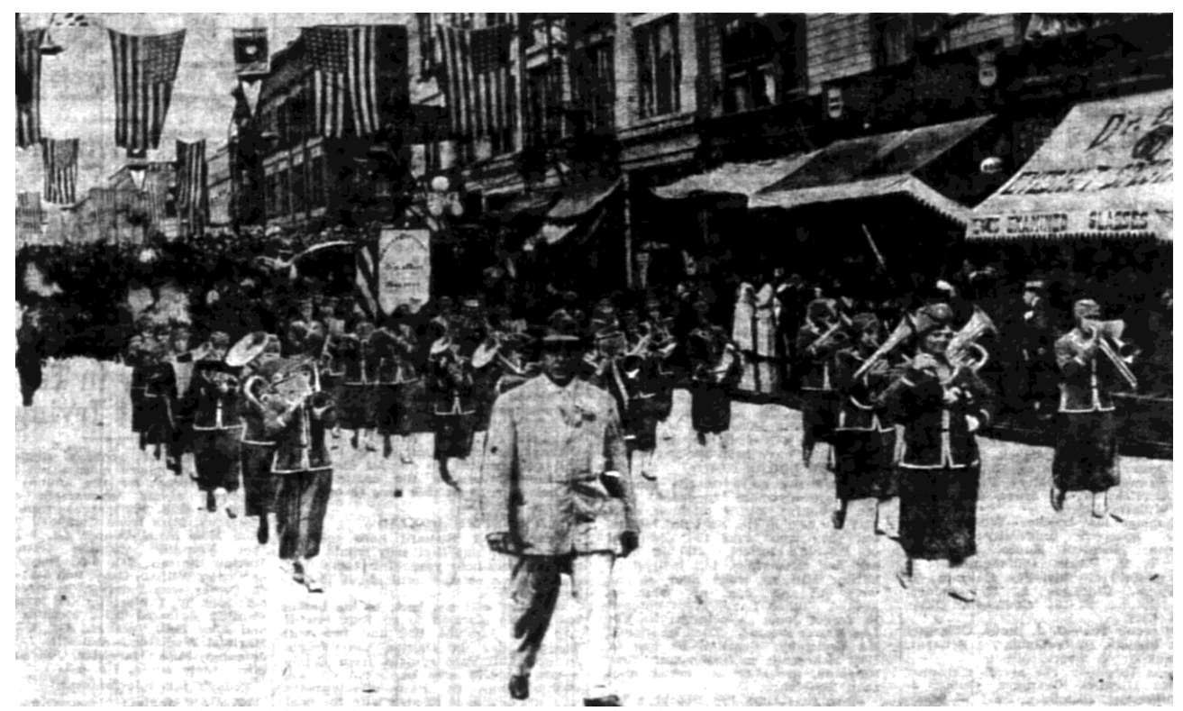
The girls' band marching in the Portland Victory Rose Festival Parade

they ended their day in Portland by serenading the staff at the offices of the Oregon Daily Journal.<sup>7</sup>