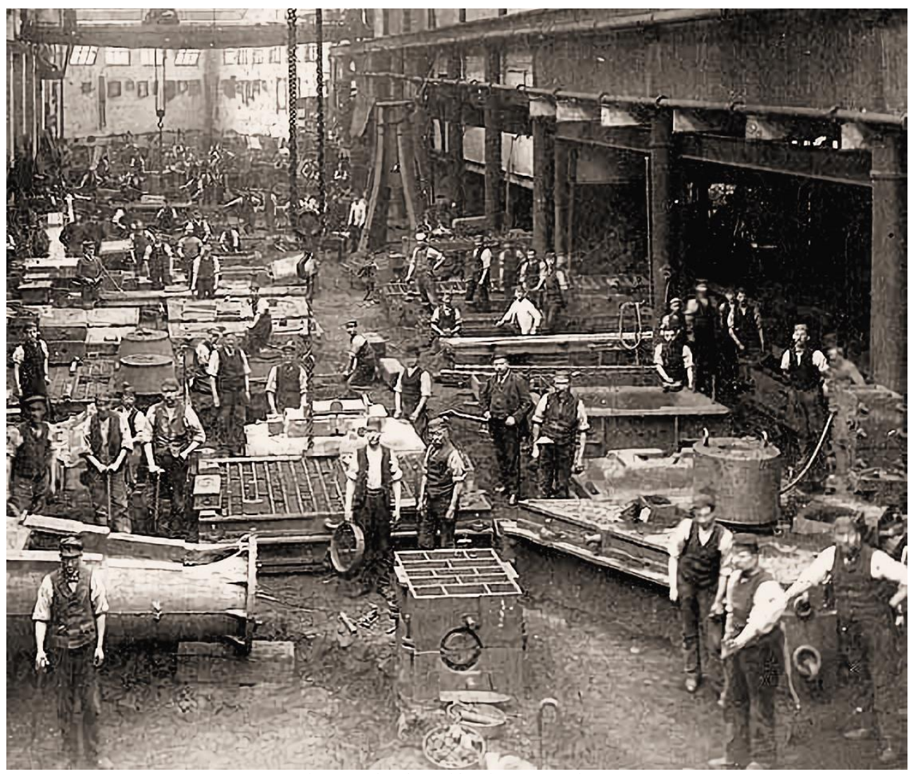
Mather & Platt's Salford Ironworks, 1893