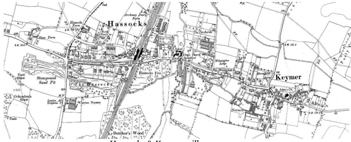
Hassocks & Keymer villages, c. 1910