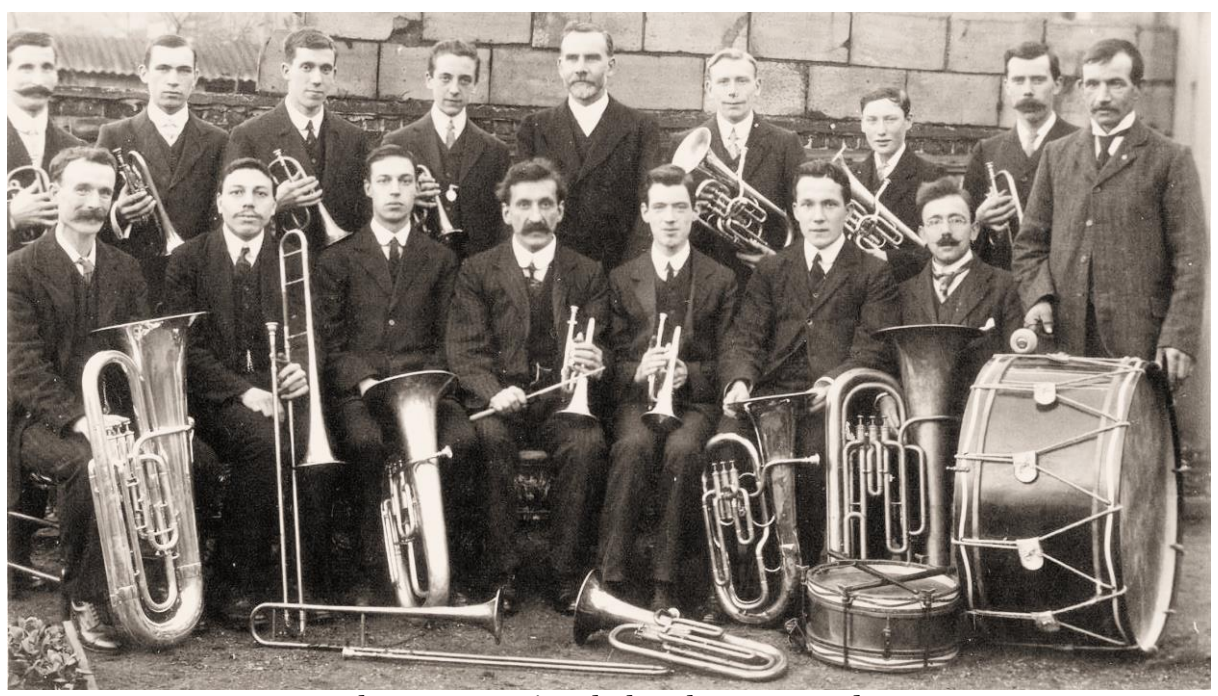
Hassocks Congregational Church Brass Band, c. 1911