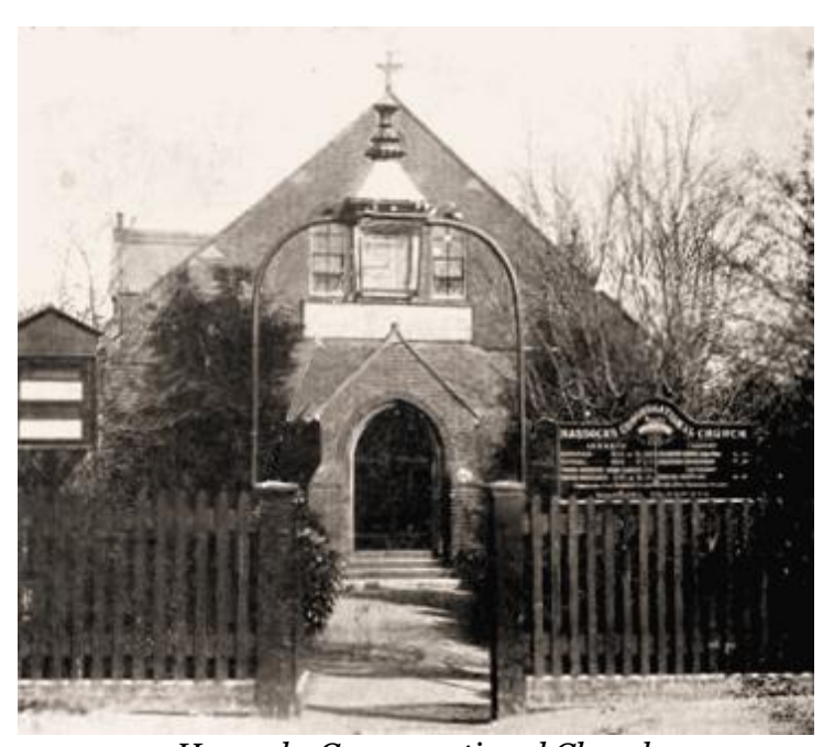
Hassocks Congregational Church