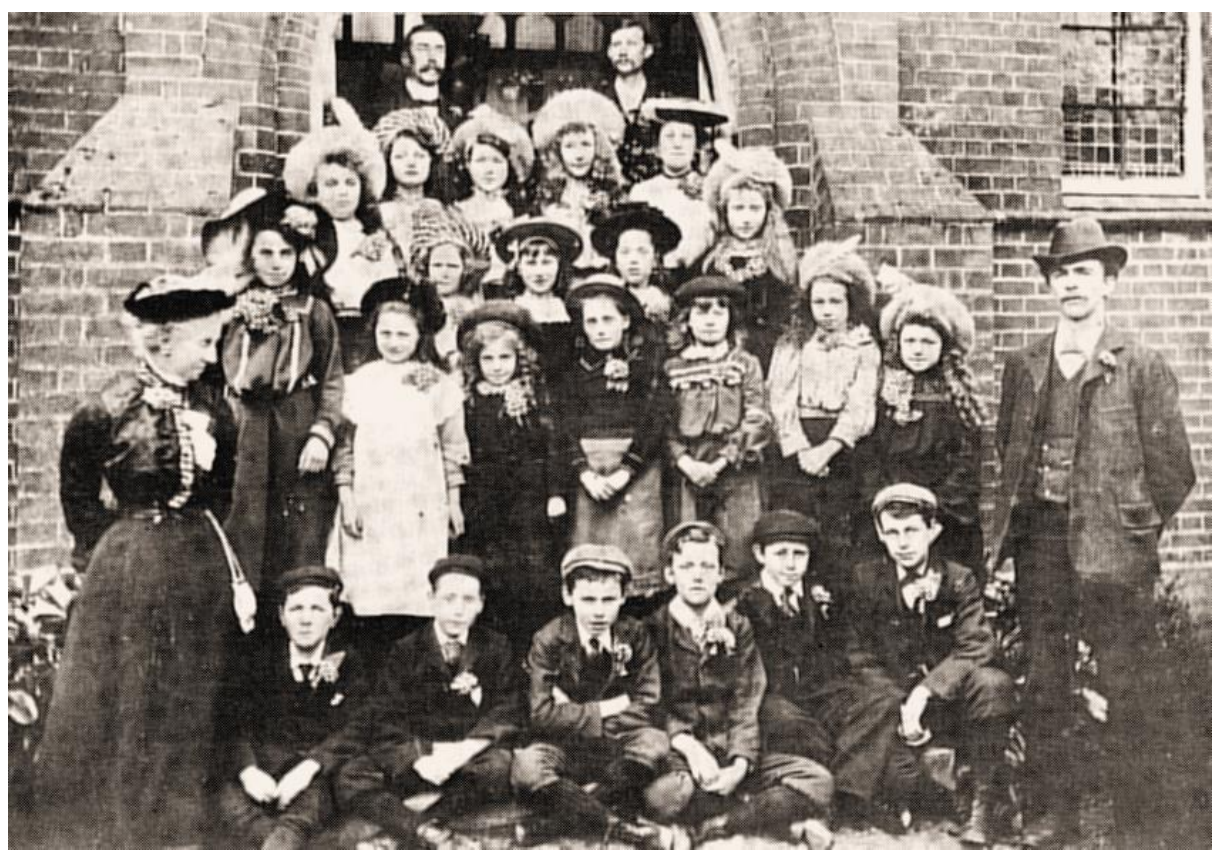
Members of Hassocks Congregational Church

The band does not reappear until the late 1920's. Further research is required to determine the fate of the band after 1911. It is most probable that it did not survive WW1, but was re-established some 15 years later.