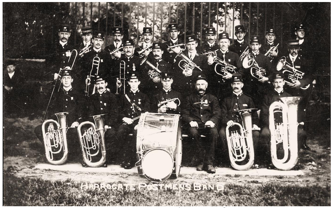
Harrogate Postmen's Brass Band

Harrogate Postmen's Brass Band (Yorkshire West Riding) - Active in the 1890s and 1900s