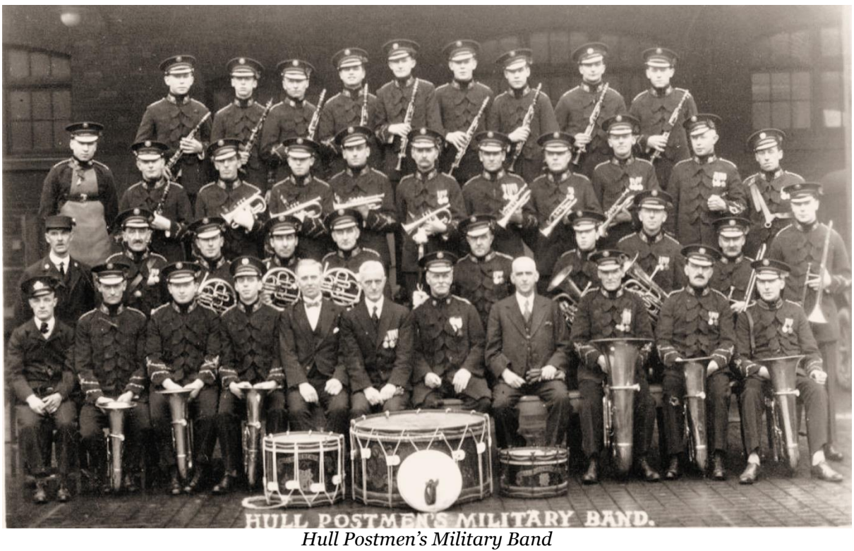
Leeds Post Office Brass Band (Yorkshire West Riding) - See: Leeds Postmen's Band Leeds Postmen's Brass Band (Yorkshire West Riding) - Founded in 1889, disbanded in 1899