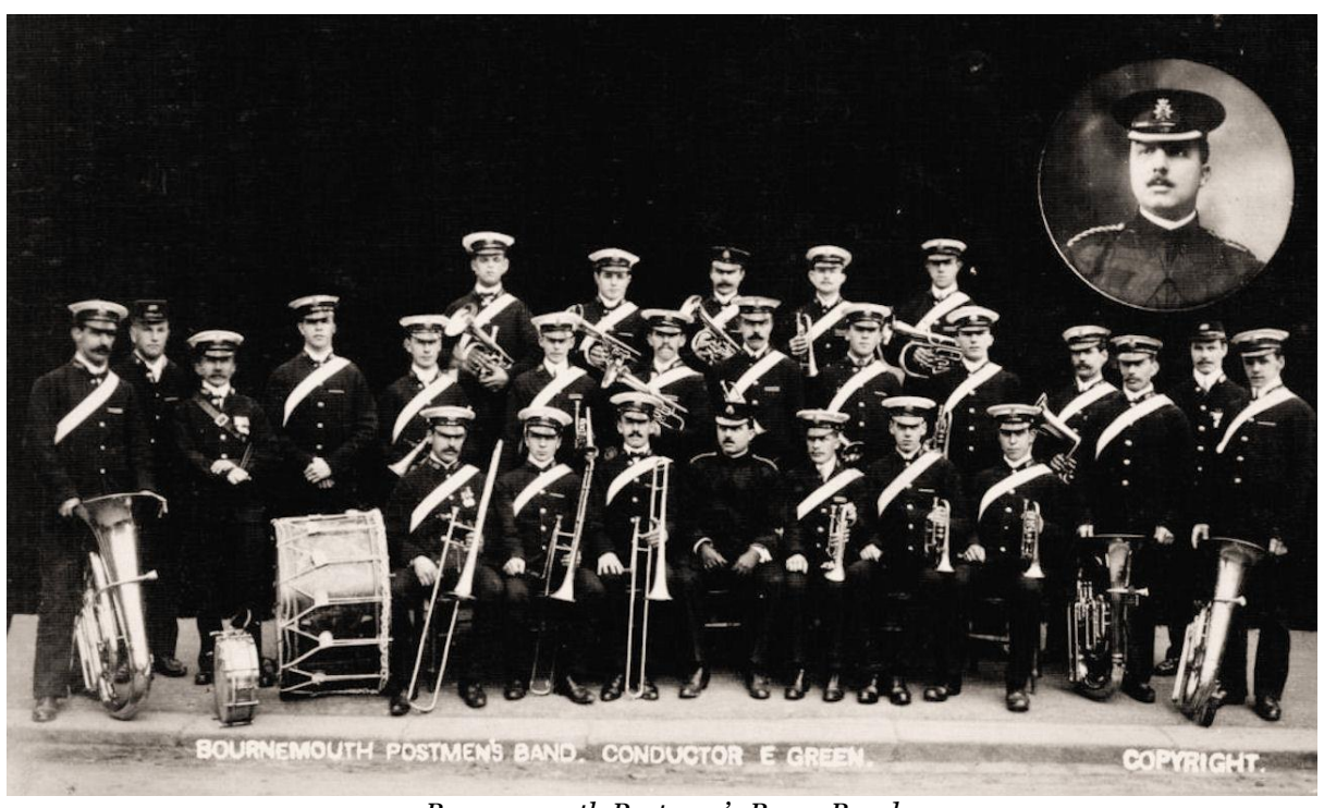
Bournemouth Postmen's Brass Band