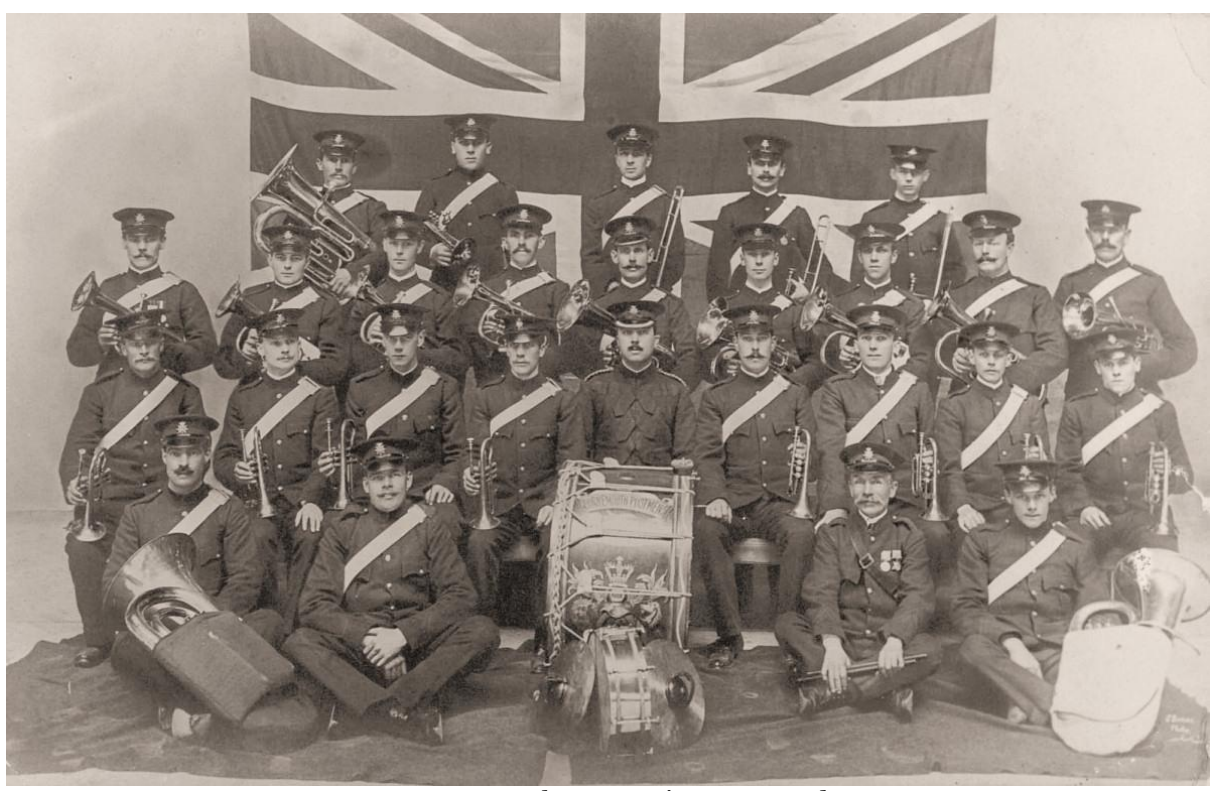
Bournemouth Postmen's Brass Band