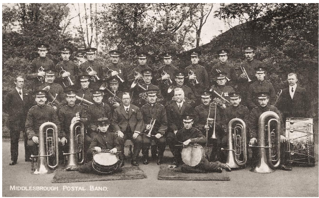
Middlesbrough Postal Band, 1913

Middlesbrough Postal Band (Yorkshire North Riding) - Active in the 1910s, reforming after WW1 in 1919, bandmaster T. White