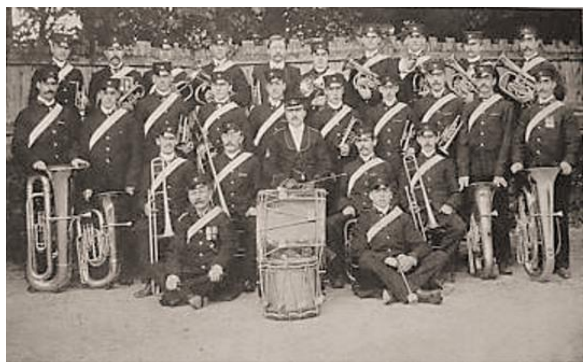
Bournemouth Postmen's Brass Band, 1906

Bradford Letter Carriers' Brass Band (Yorkshire West Riding) - See: Bradford Postmen's Band