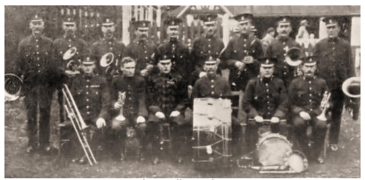
Bath Post Office Band, 1920

An early appearance by the band was at the annual Bath Postmen's parade in July 1894, in which 100 local postmen and telegraph boys took part, together with a similar number of uniformed postal workers from nearby towns. They followed this with a similar parade of postmen in Bristol the next month.