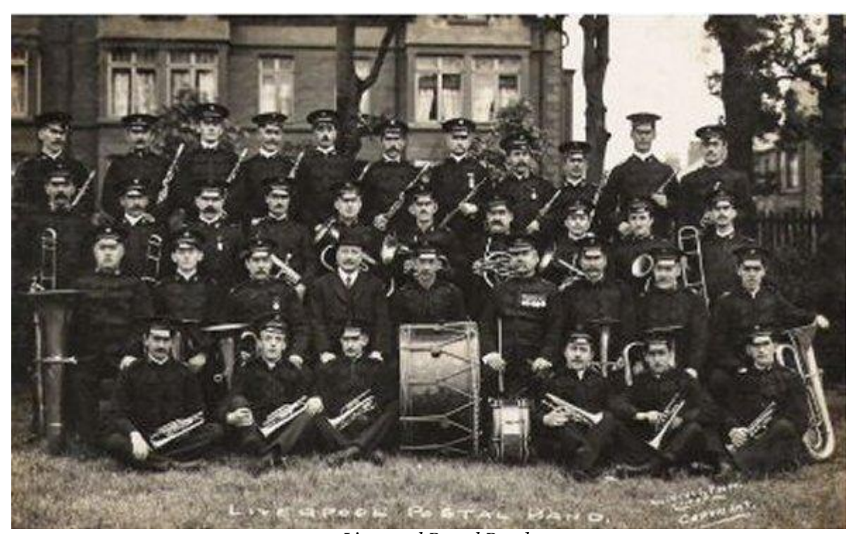
Liverpool Postal Band