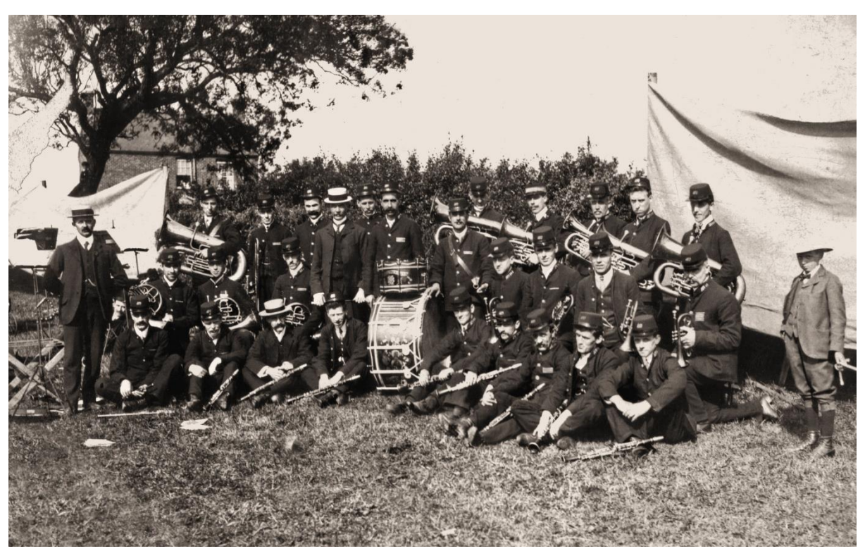
Hull Post Office Band