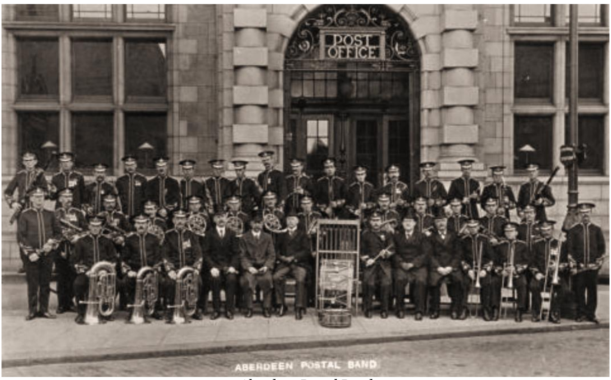
Aberdeen Postal Band

Ascot Post Office Band (Berkshire) - See: Ascot Brass Band