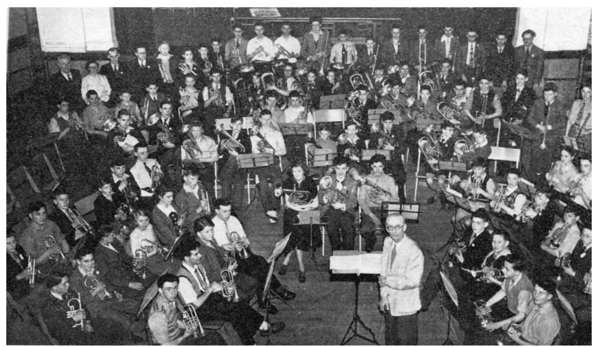
NYBB inaugural course, Easter 1952, Bradford, conductor Denis Wright

The following photographs are some early examples of those taken at each course as a record of the band and its members.