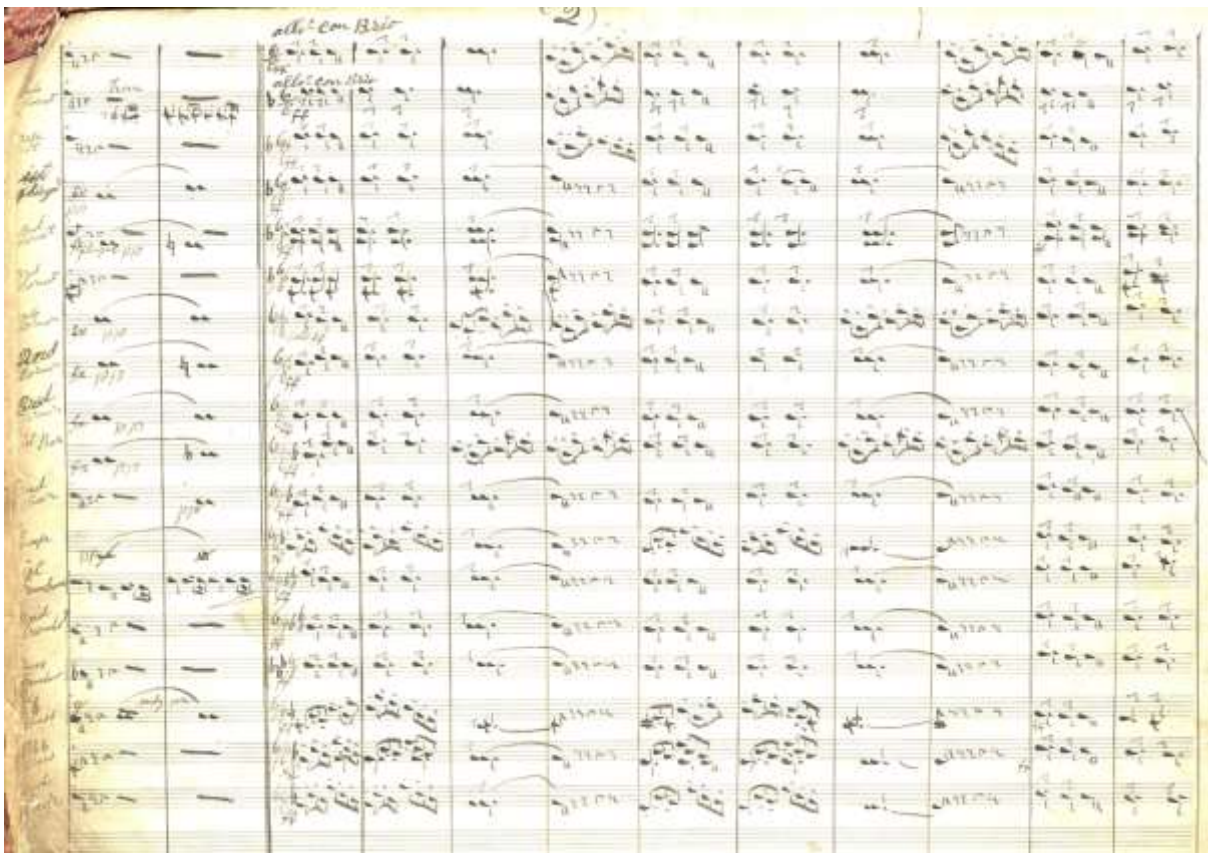
Page 2 of Rossini's Works