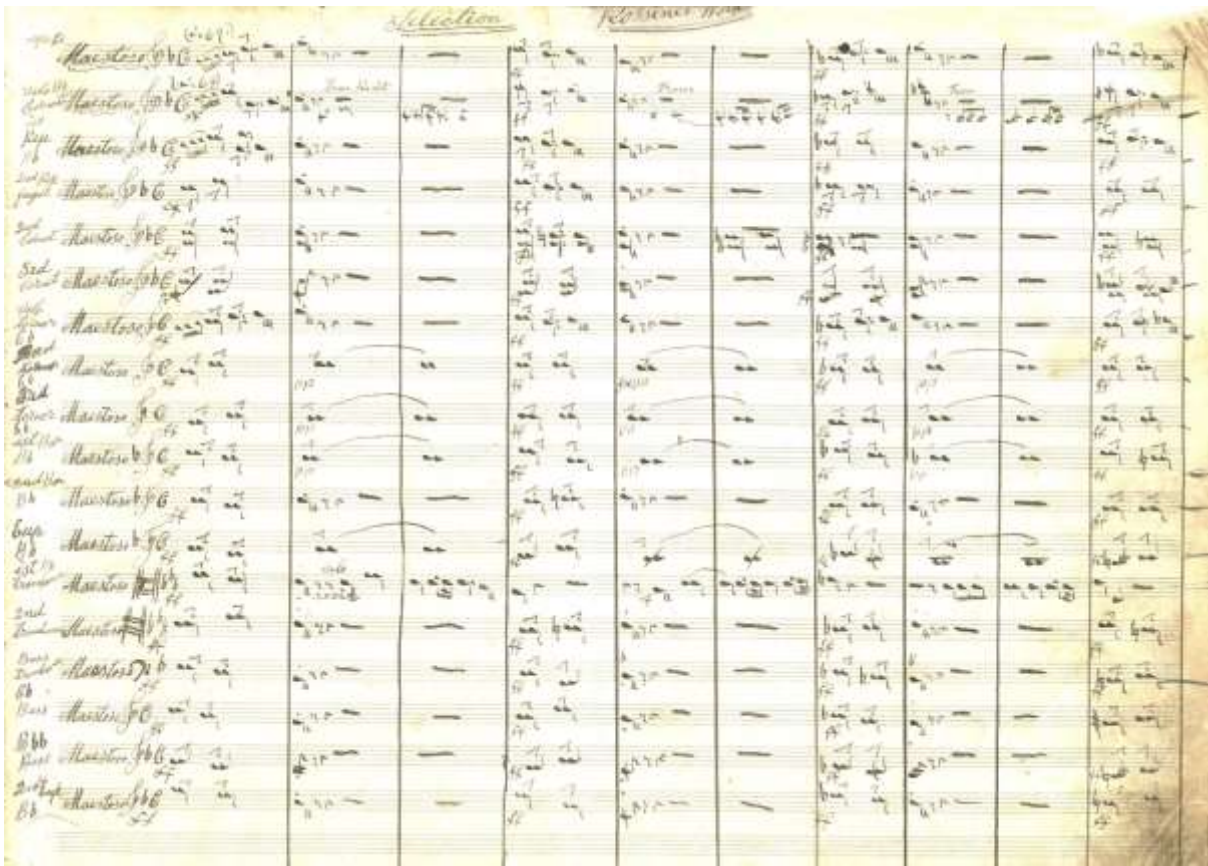
Page 1 of Rossini's Works