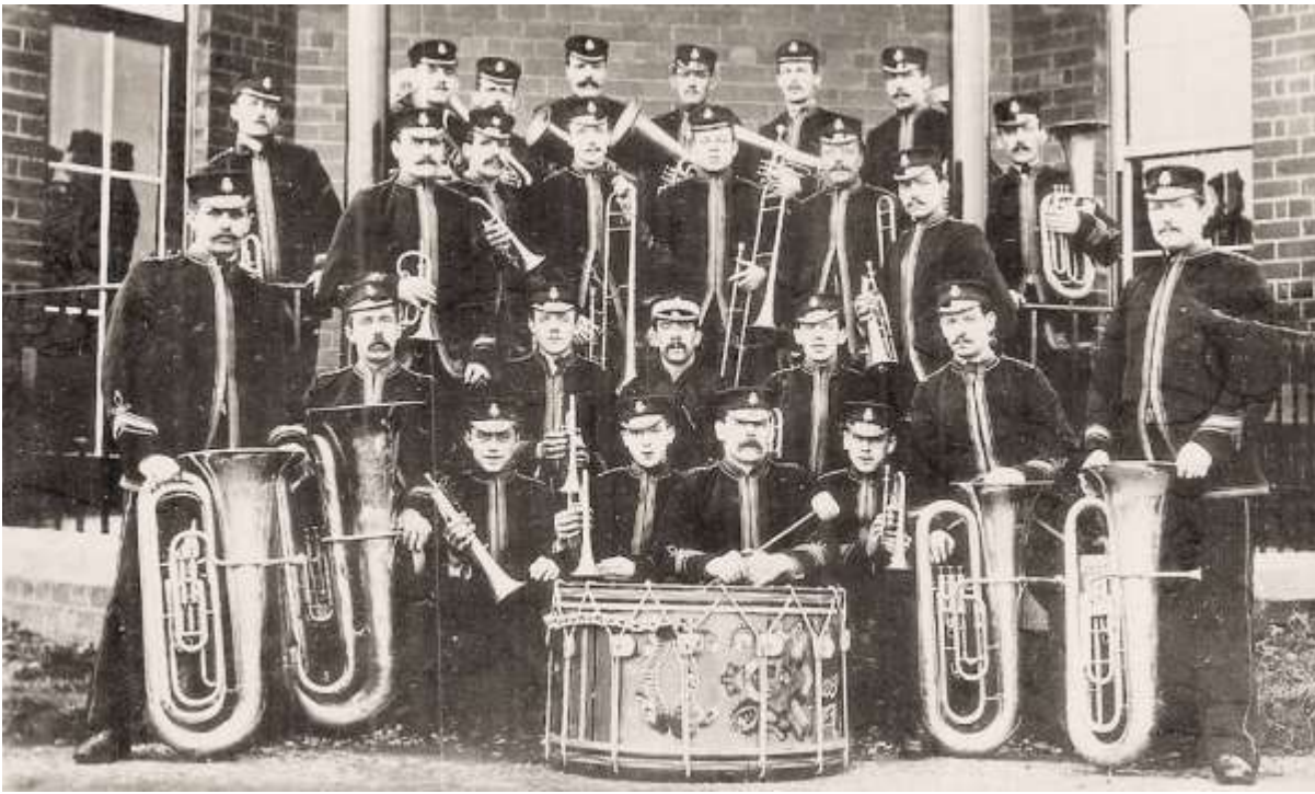
Rothwell Temperance Band 1903